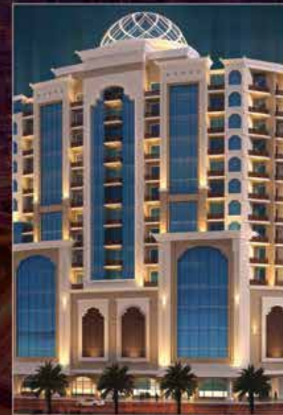
DOME BUILDING AL JADDAF