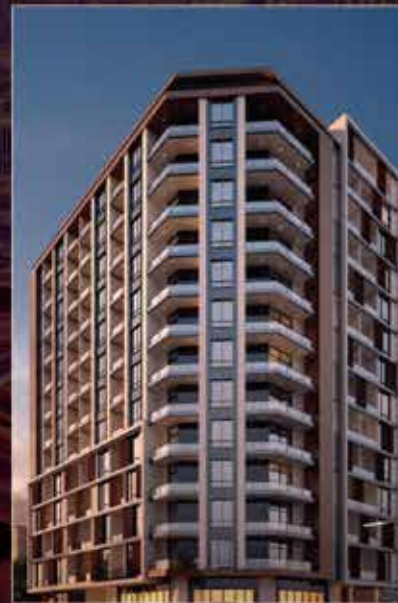
AL NAHDA TOWER