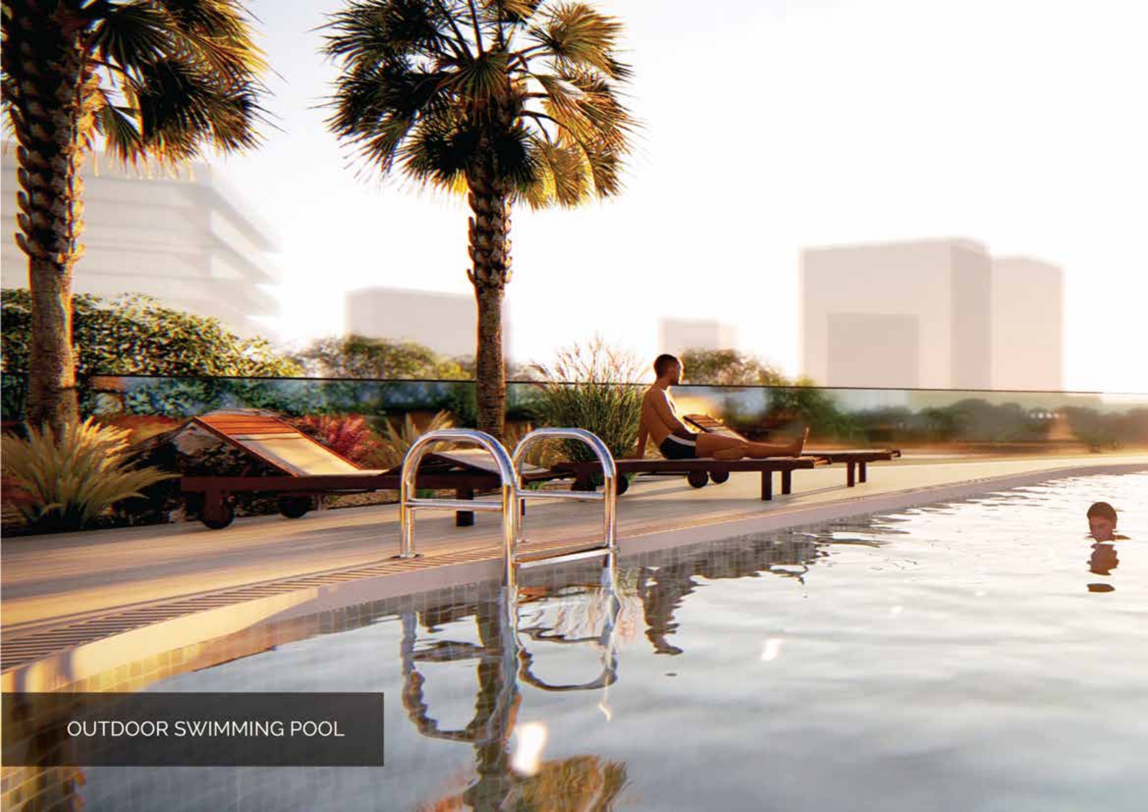
OUTDOOR SWIMMING POOL