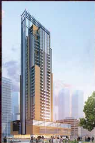
THE SQUARE TOWER