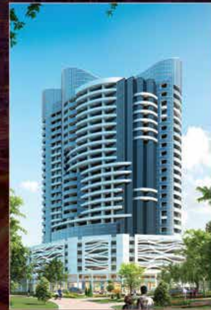
BLUE WAVES TOWER