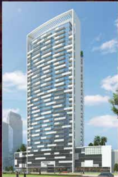
AL JAWHARA TOWER