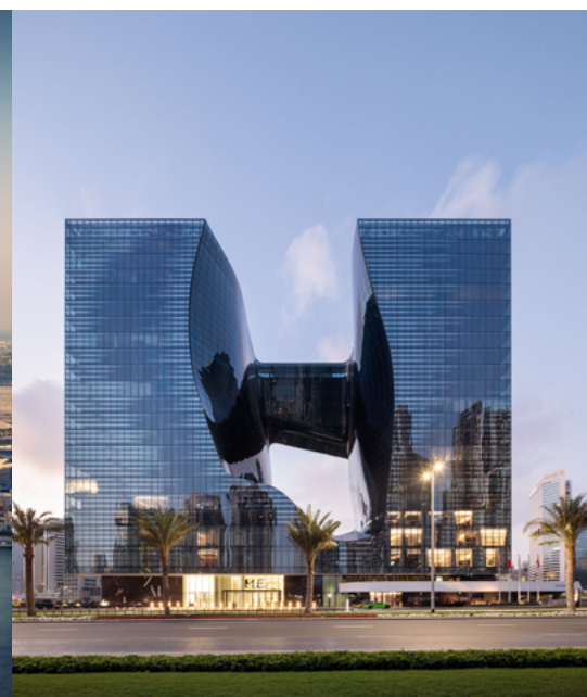
THE OPUS BY OMNIYAT, DESIGNED BY ZAHA HADID