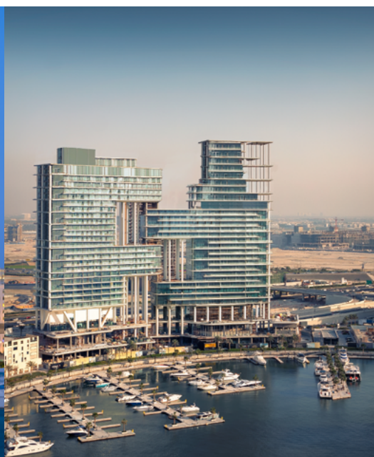
THE RESIDENCES, DORCHESTER COLLECTION, DUBAI