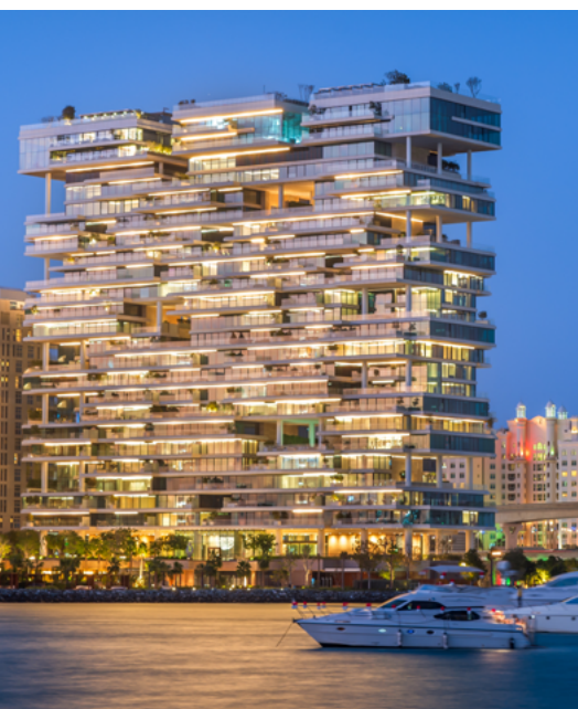
ONE AT PALM JUMEIRAH, DORCHESTER COLLECTION, DUBAI

OMNIYAT's impressive portfolio, with a combined gross realisation of over AED 17 billion, includes stars such as The Opus by OMNIYAT, One at Palm Jumeirah, Dorchester Collection, Dubai and The Residences, Dorchester Collection, Dubai.