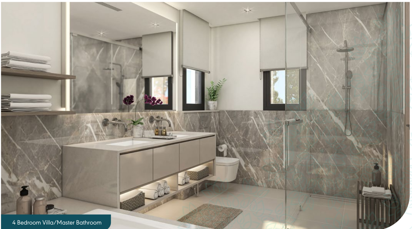
4 Bedroom Villa/Master Bathroom