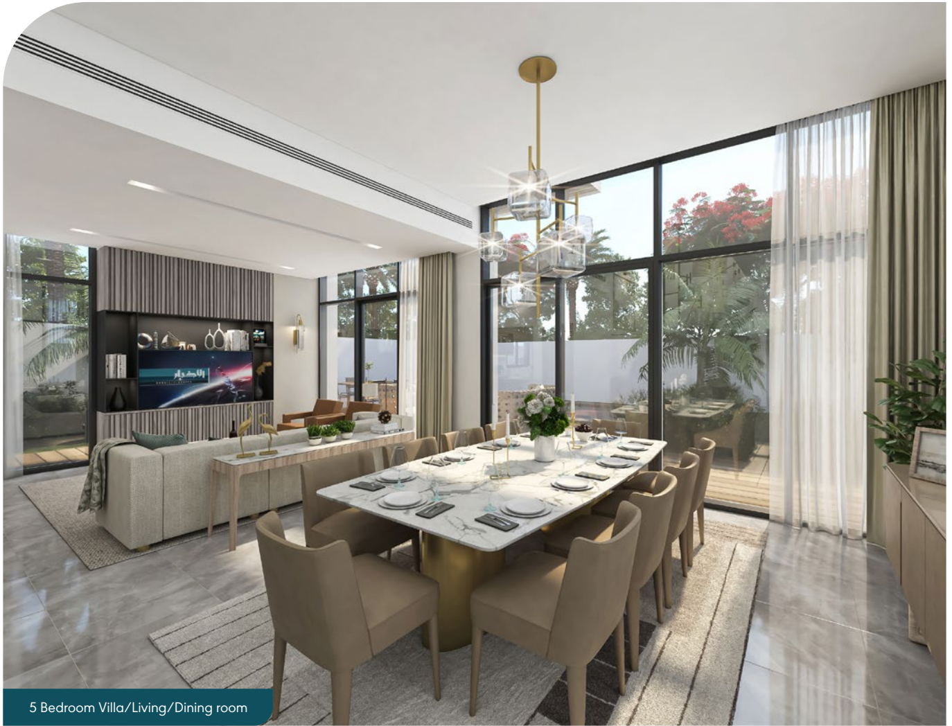
5 Bedroom Villa/Living/Dining room