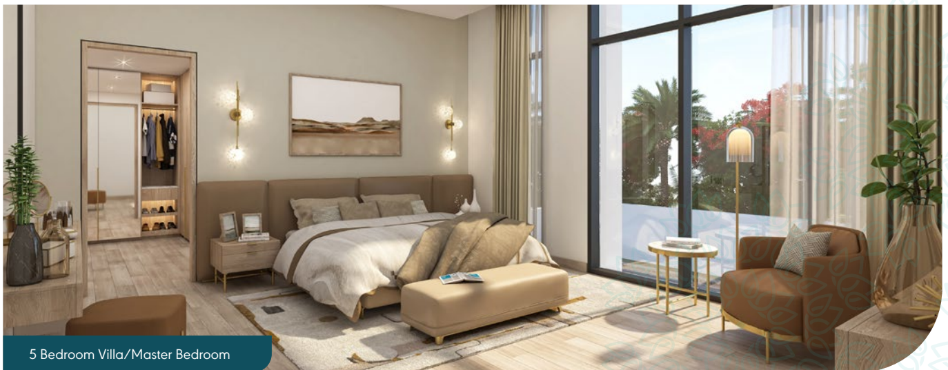
5 Bedroom Villa/Master Bedroom

Villas are available with a choice of layout options and the opportunity to design a home that uniquely suits you.