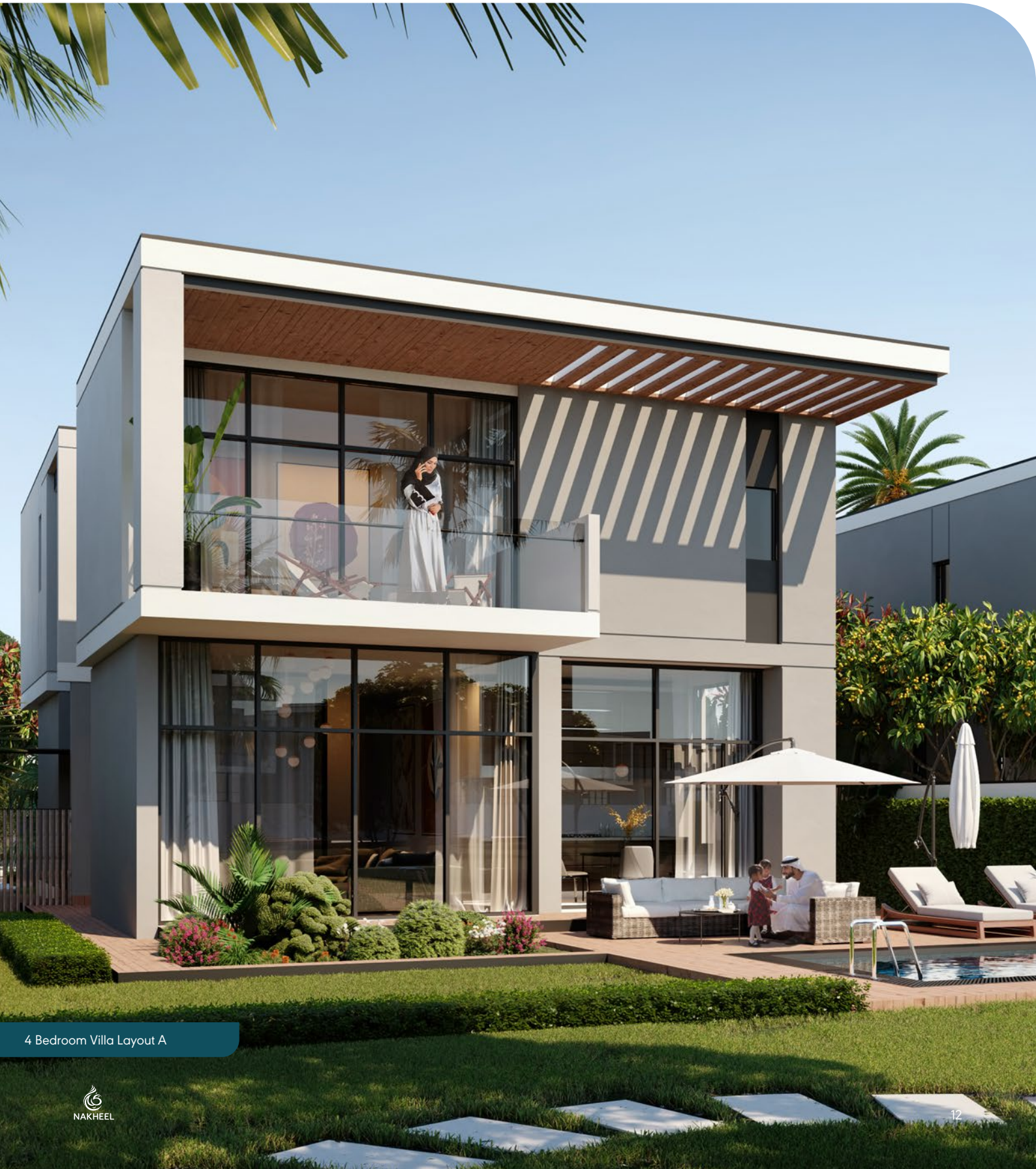
4 Bedroom Villa Layout A

The four bedroom villa design retains all the elegance and modernity of the five-bedroom villa designs. These homes still feature a garage with space for three cars, an elevated large shaded balcony that overlooks the rear garden and a swimming pool.