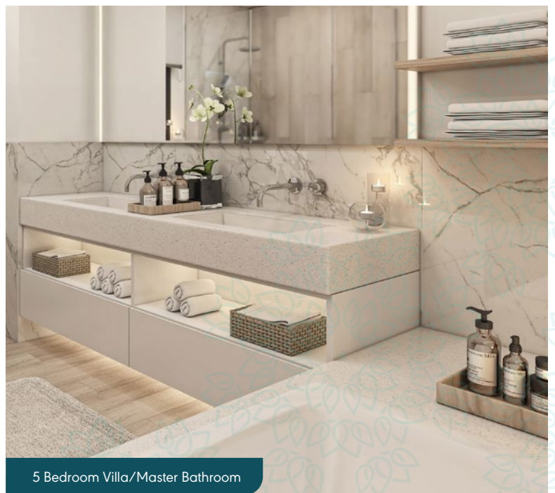
5 Bedroom Villa/Master Bathroom