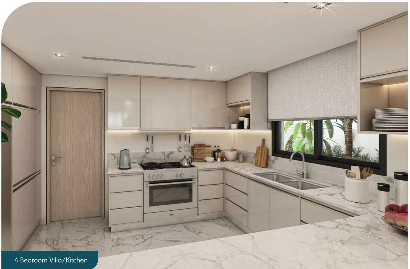
4 Bedroom Villa/Kitchen