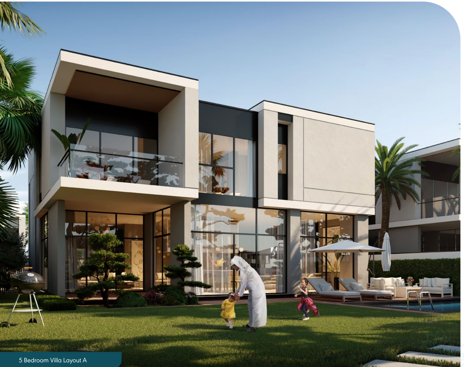
5 Bedroom Villa Layout A

In the designs of the five-bedroom and four-bedroom villas, modernity speaks volumes. A grand entrance foyer offers a welcoming and impressive greeting area that leads to an expansive living room with floor-to-ceiling windows framing stunning views of the garden.