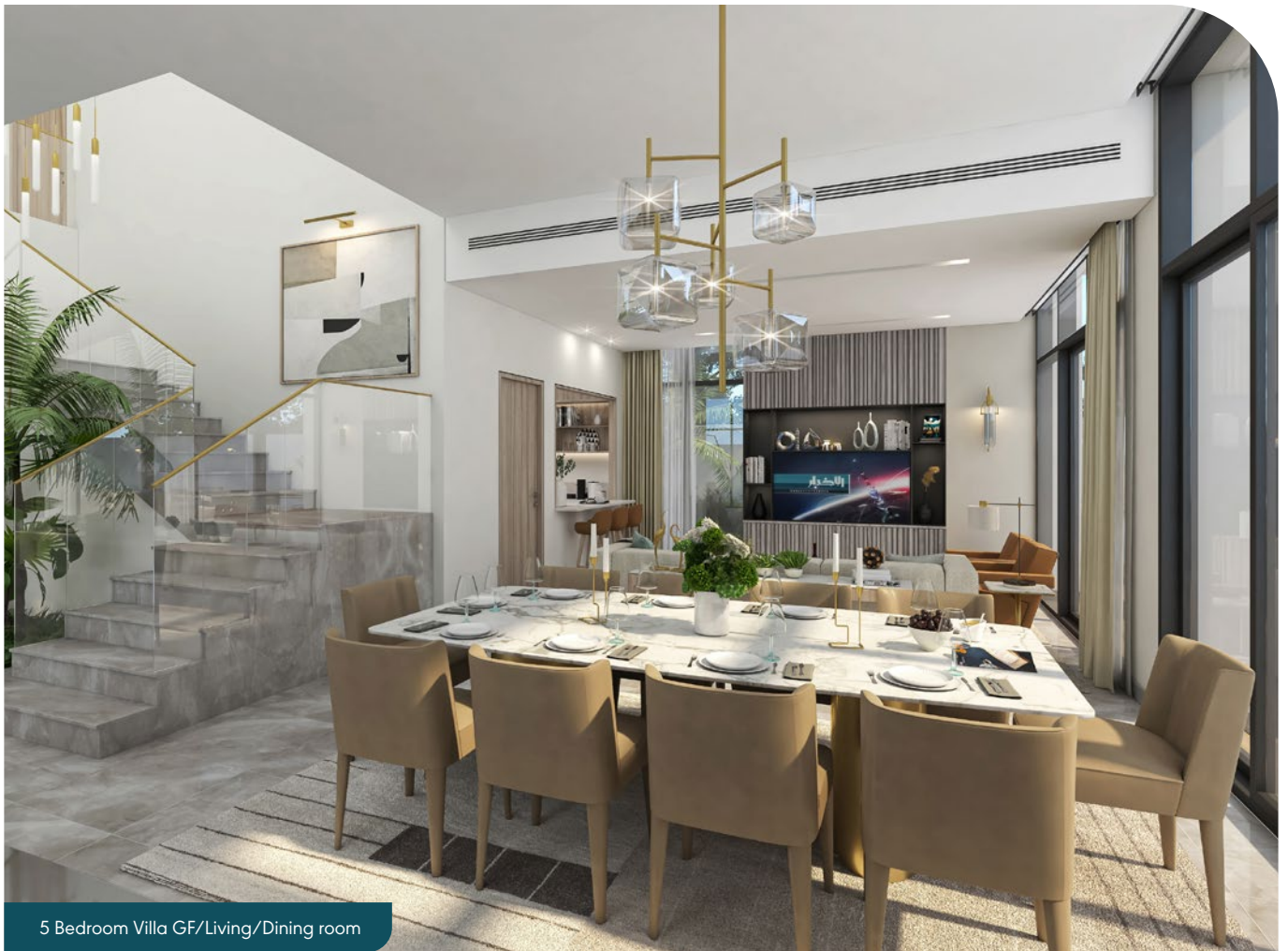
5 Bedroom Villa GF/Living/Dining room