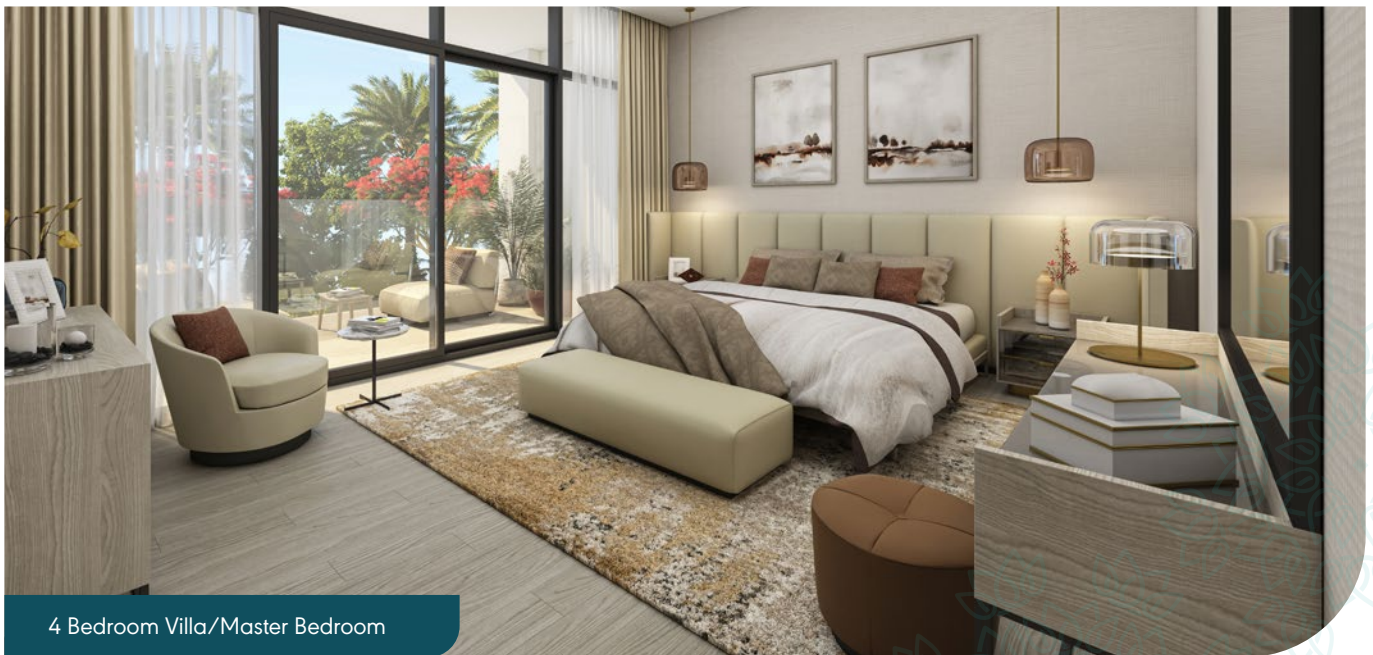
4 Bedroom Villa/Master Bedroom

The entrance foyer leads directly into the living area, benefitting from the natural light coming in through the floor-to-ceiling glazing and offering a view of the rear garden. On the ground floor is a closed kitchen, ample storage space, a maid's room and a guest bedroom with bathroom.