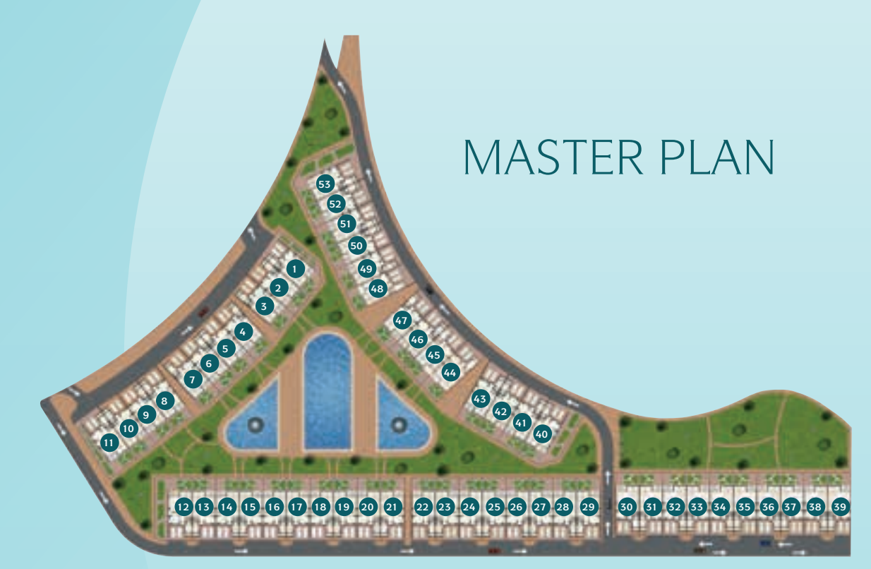
The developer reserves the right to make revisions. All the measurements and drawings are approximate. This information is subject to change without notice. Do not scale drawings. Artistic renderings, landscaping and images are for illustrative purposes only and are subject to change without notice. February 2018.

Internal Floor Area 3,630 Square Feet 2,345 Square Feet (Average)