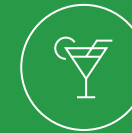
Cafe & Juice Bar