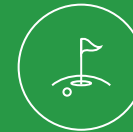
Open-Air Golf Simulator