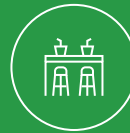
Restaurants & Cafe