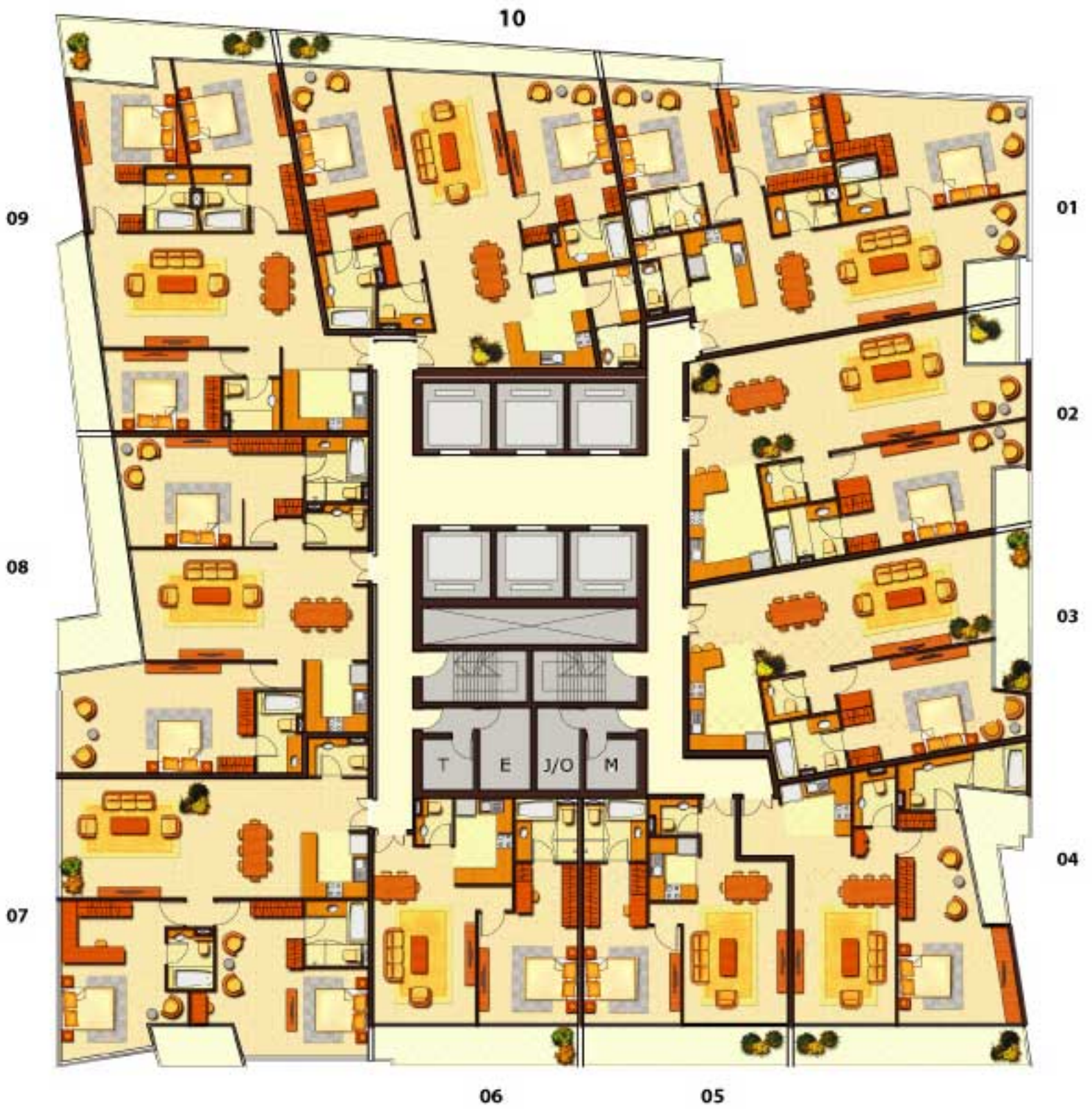
TYPICAL FLOOR PLANS

OCEAN HEIGHTS the most breathtaking of views