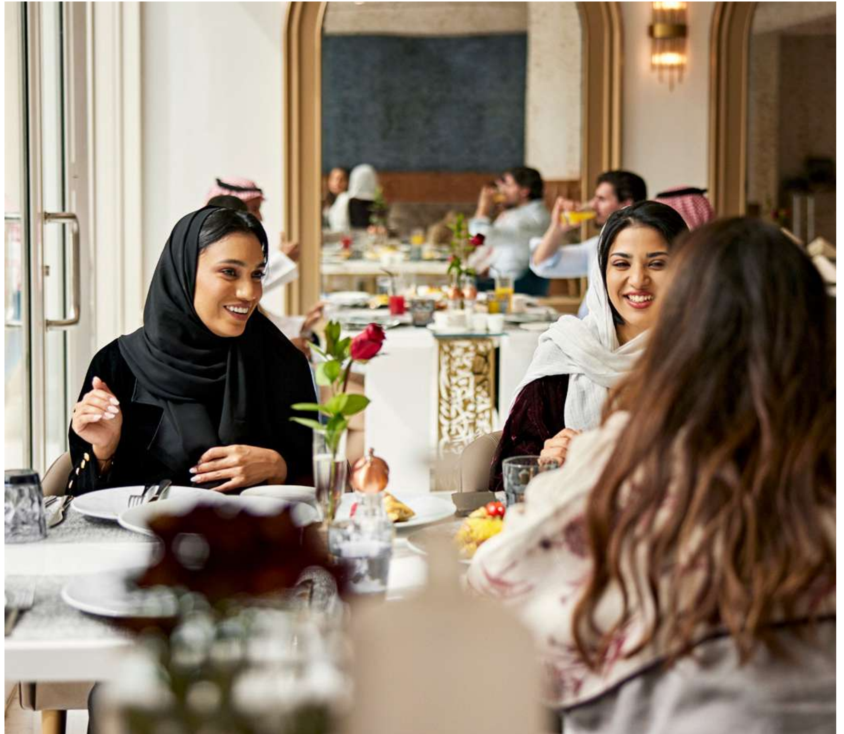
Retail & Dining