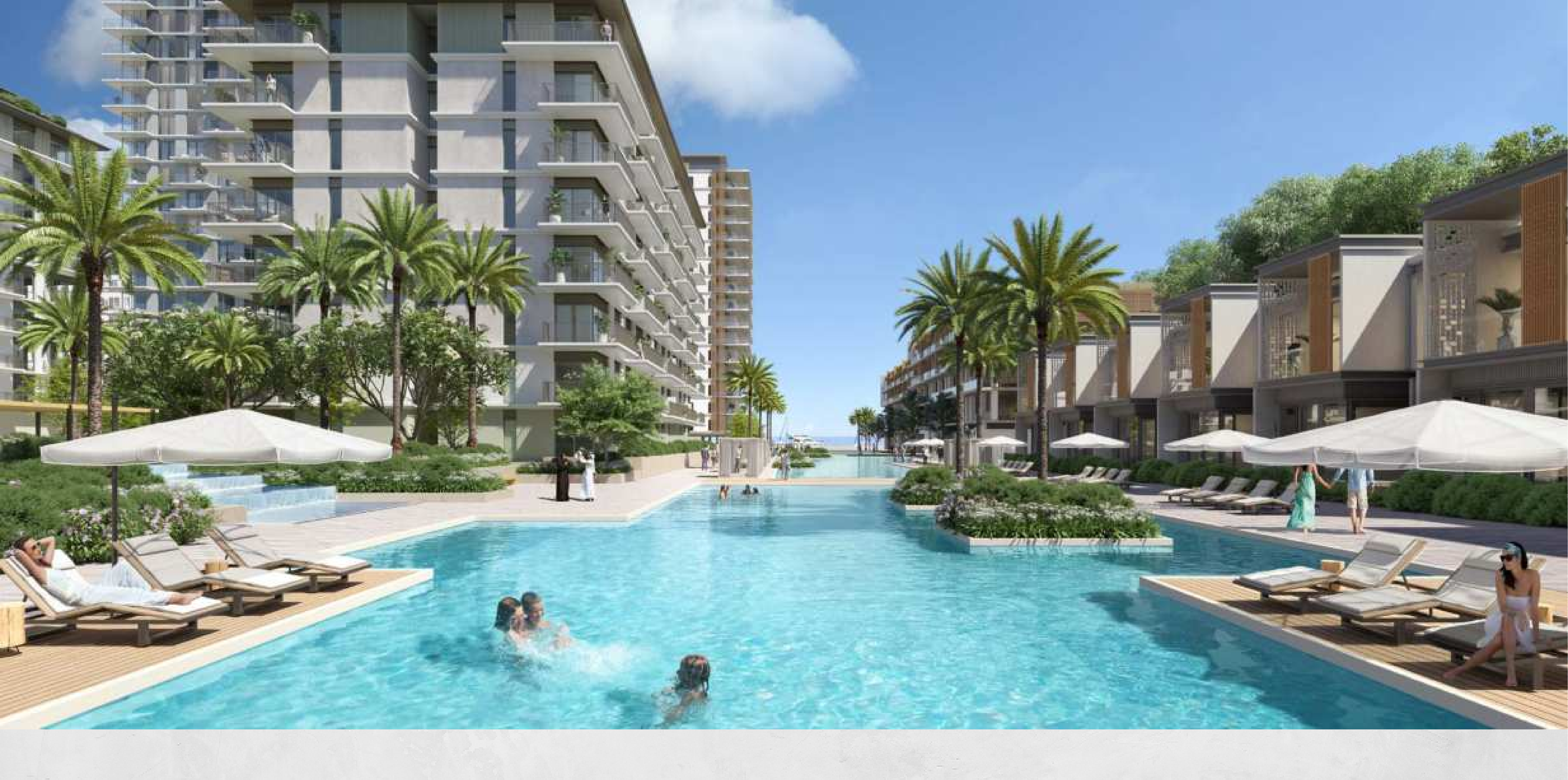
The Canal Pool