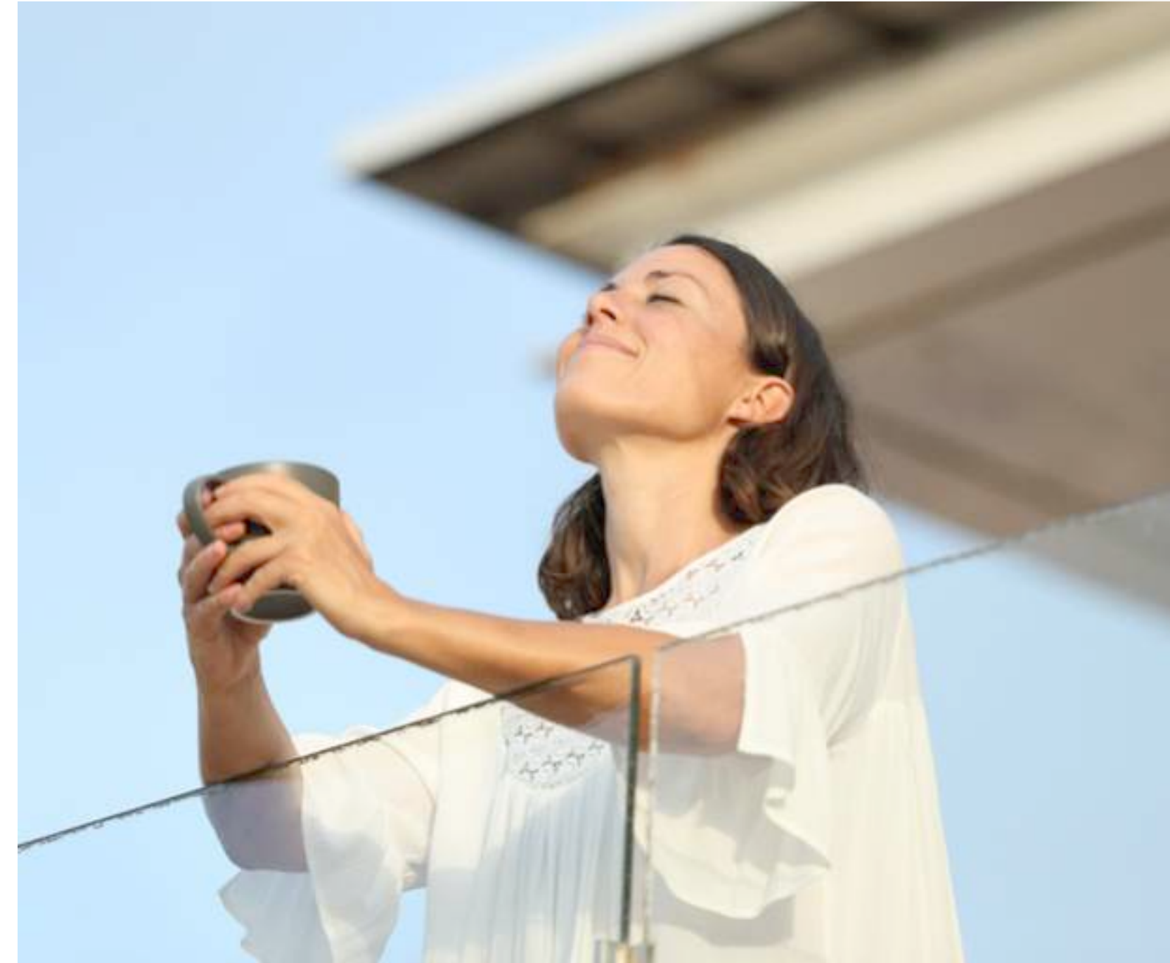
Sun shading elements (balconies & perforated panels)

Extensive landscaping with native plants or adaptable species enhances the property's beauty and value while reducing its environmental impact. Other environmentally friendly features include advanced waste management and water reuse solutions, as well as a bicycle storage area and EV parking to encourage residents to use less traditional combustion engines.