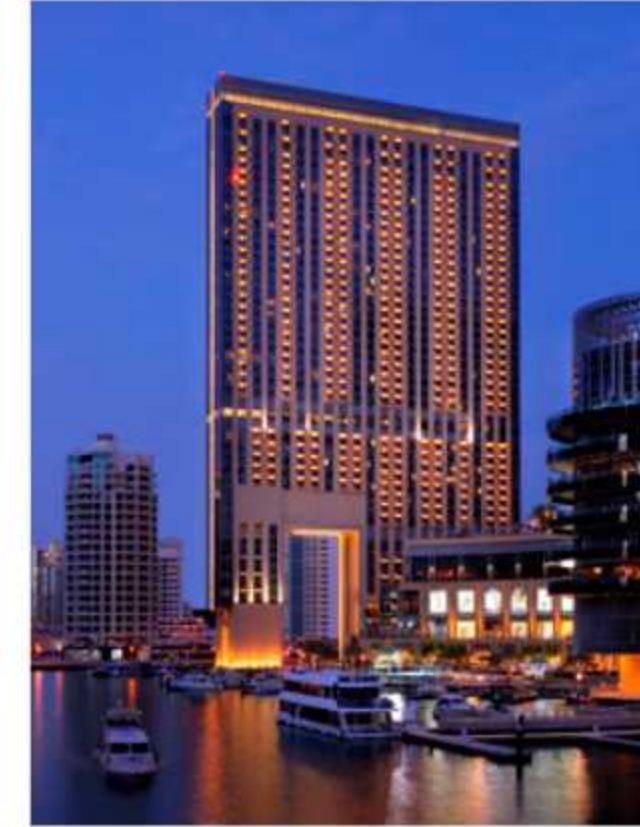
The Address Dubai Marina 5-star Premium Hotel