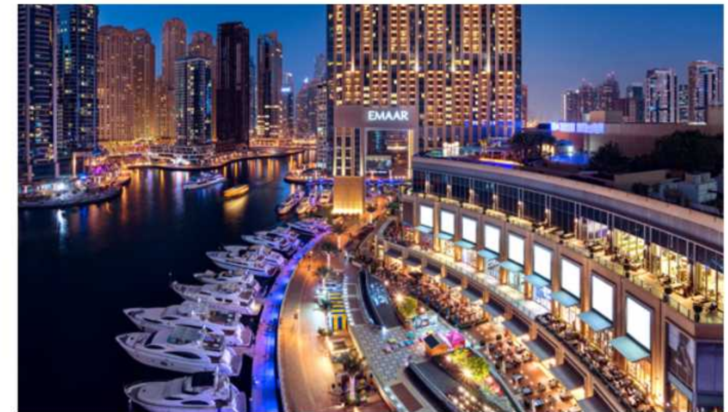
Dubai Marina Mall