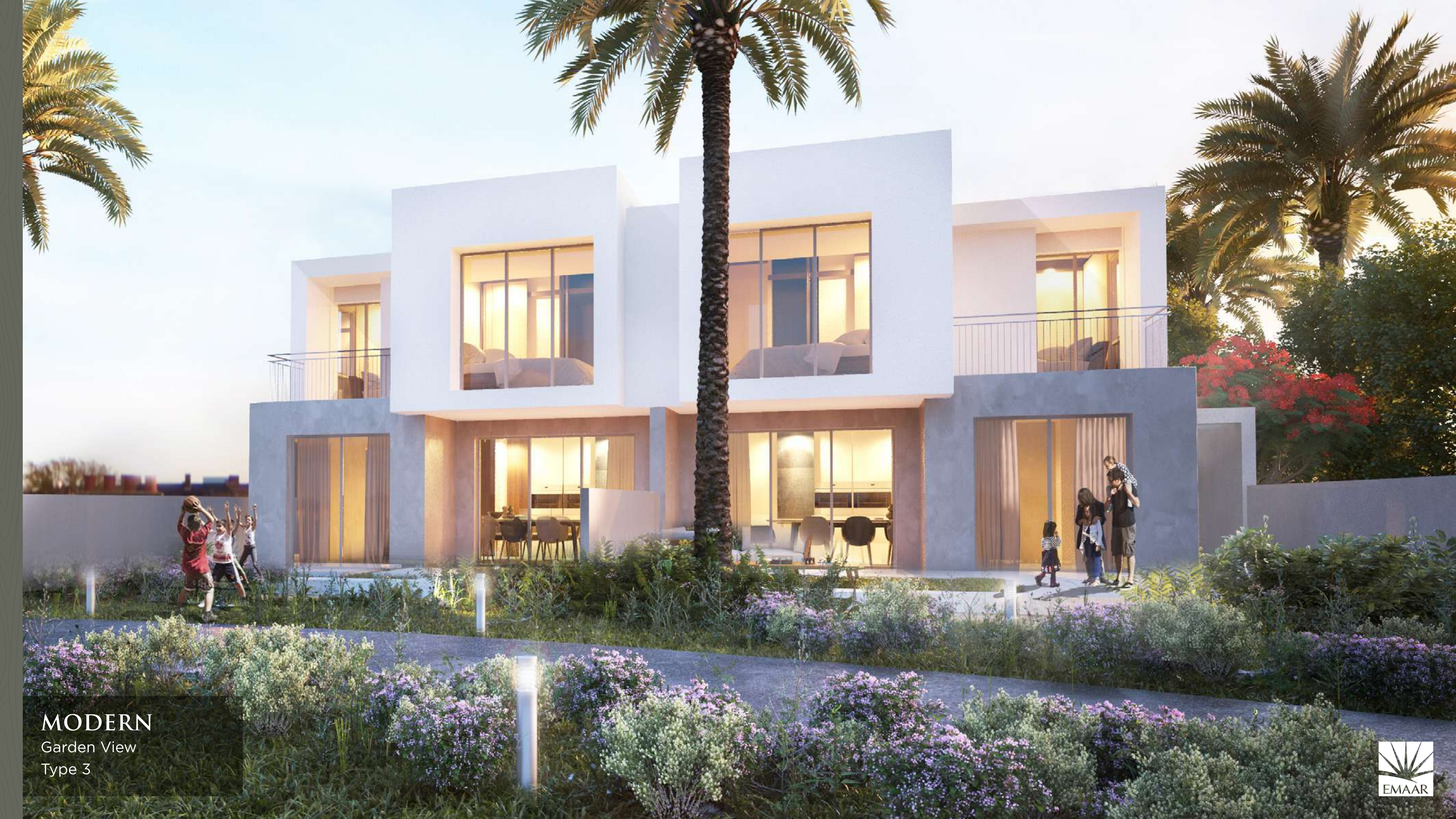
MODERN Garden View Type 3