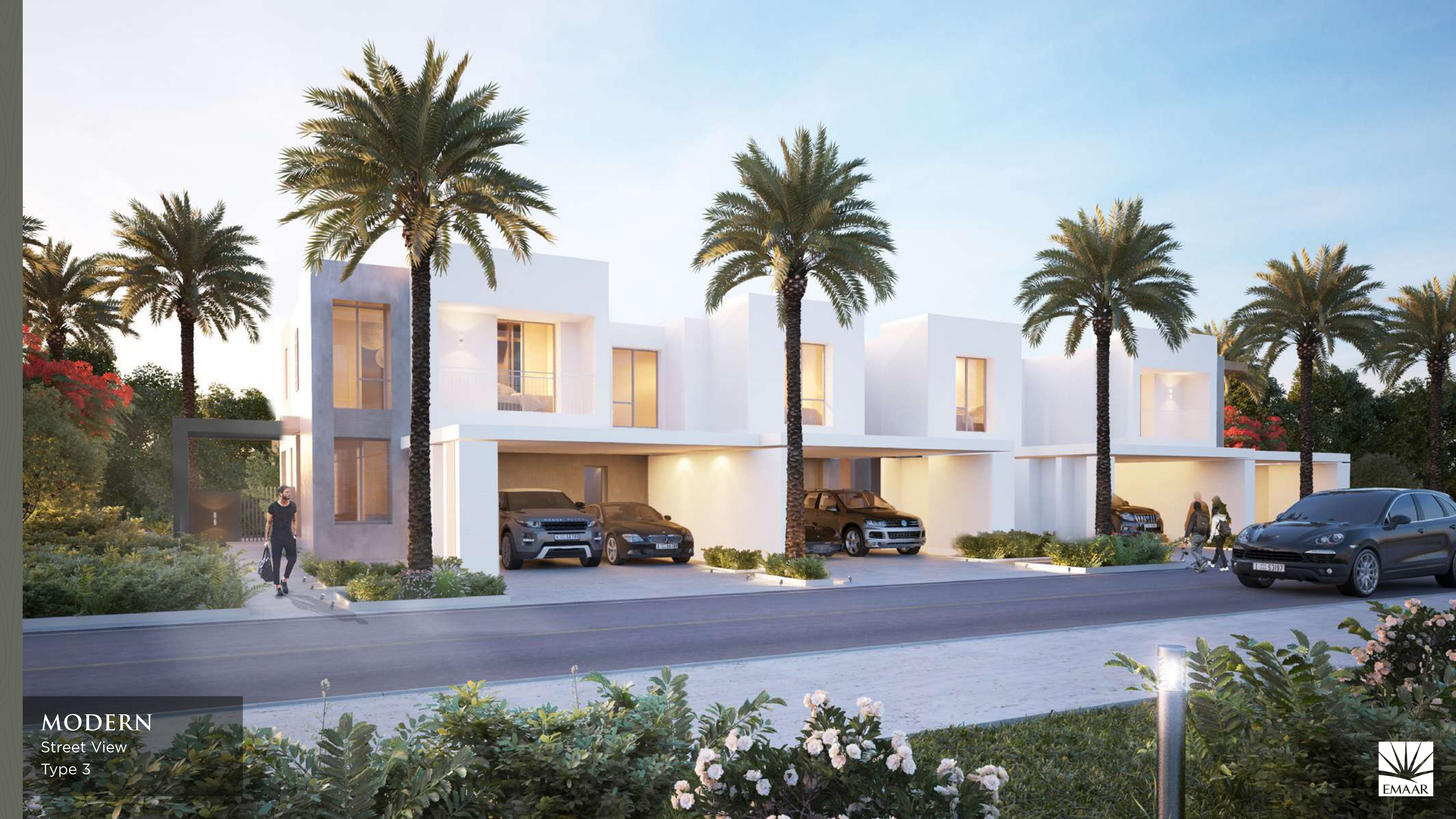
MODERN Street View Type 3