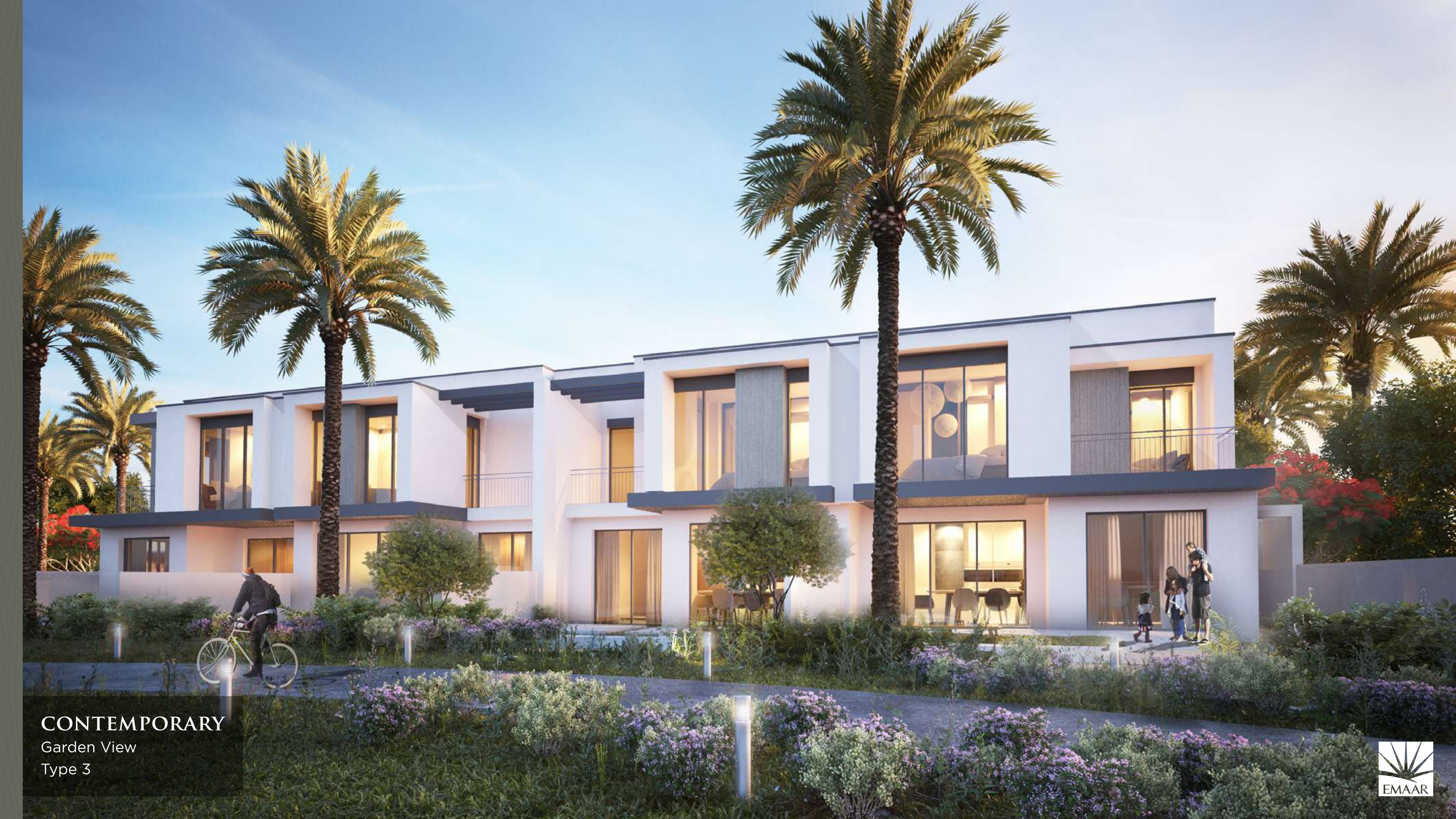
CONTEMPORARY Garden View Type 3