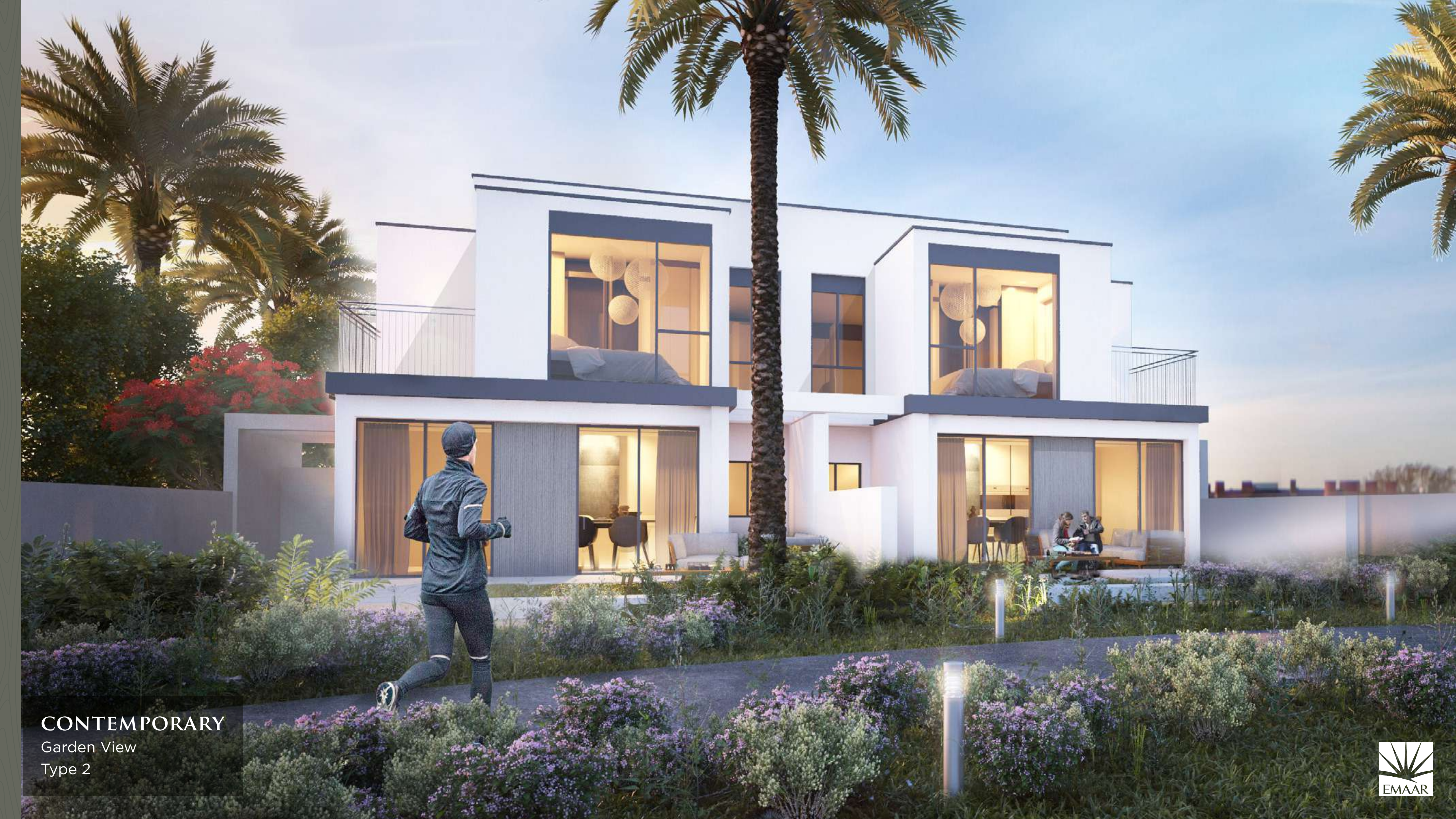
CONTEMPORARY Garden View Type 2