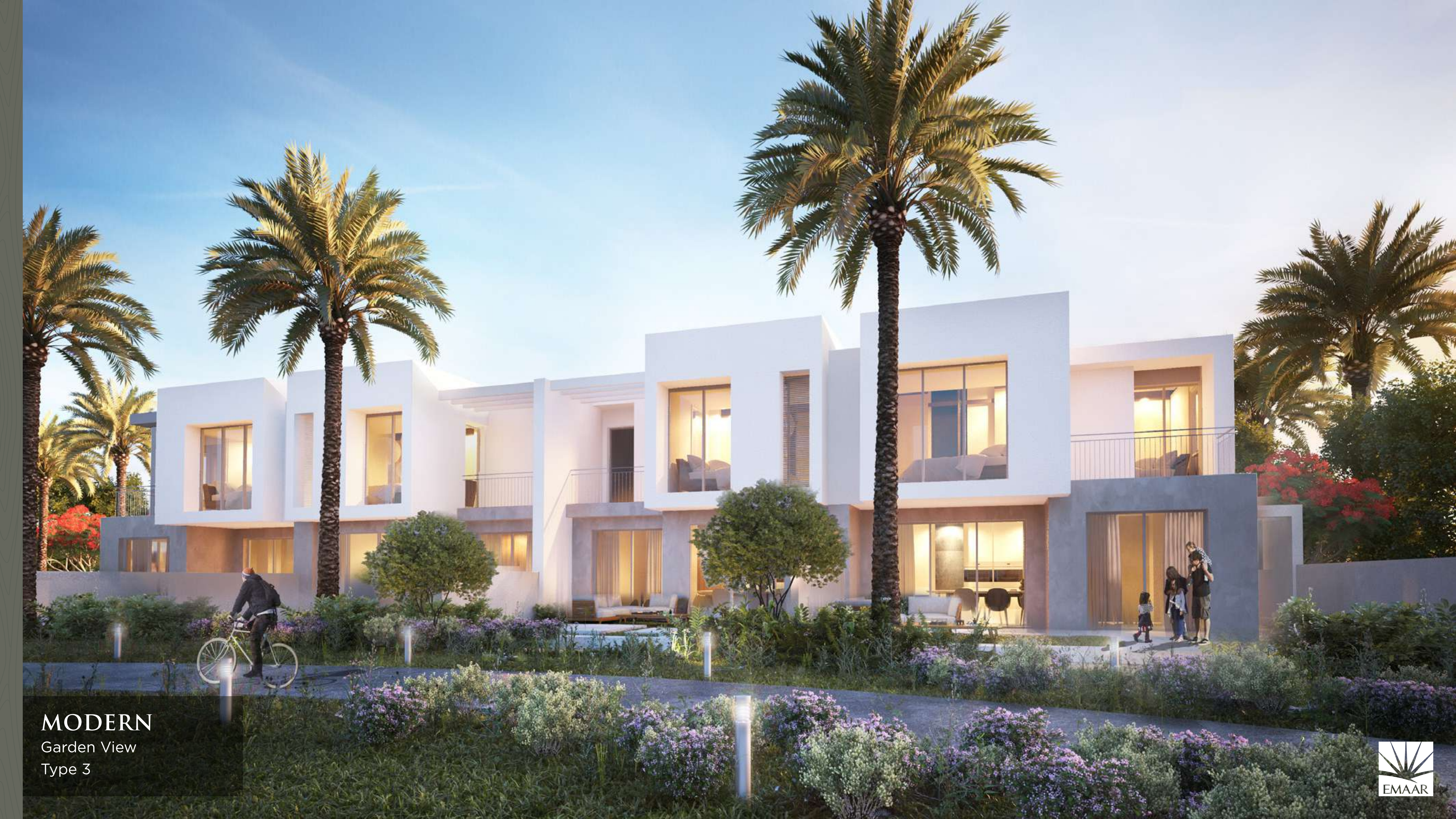
MODERN Garden View Type 3