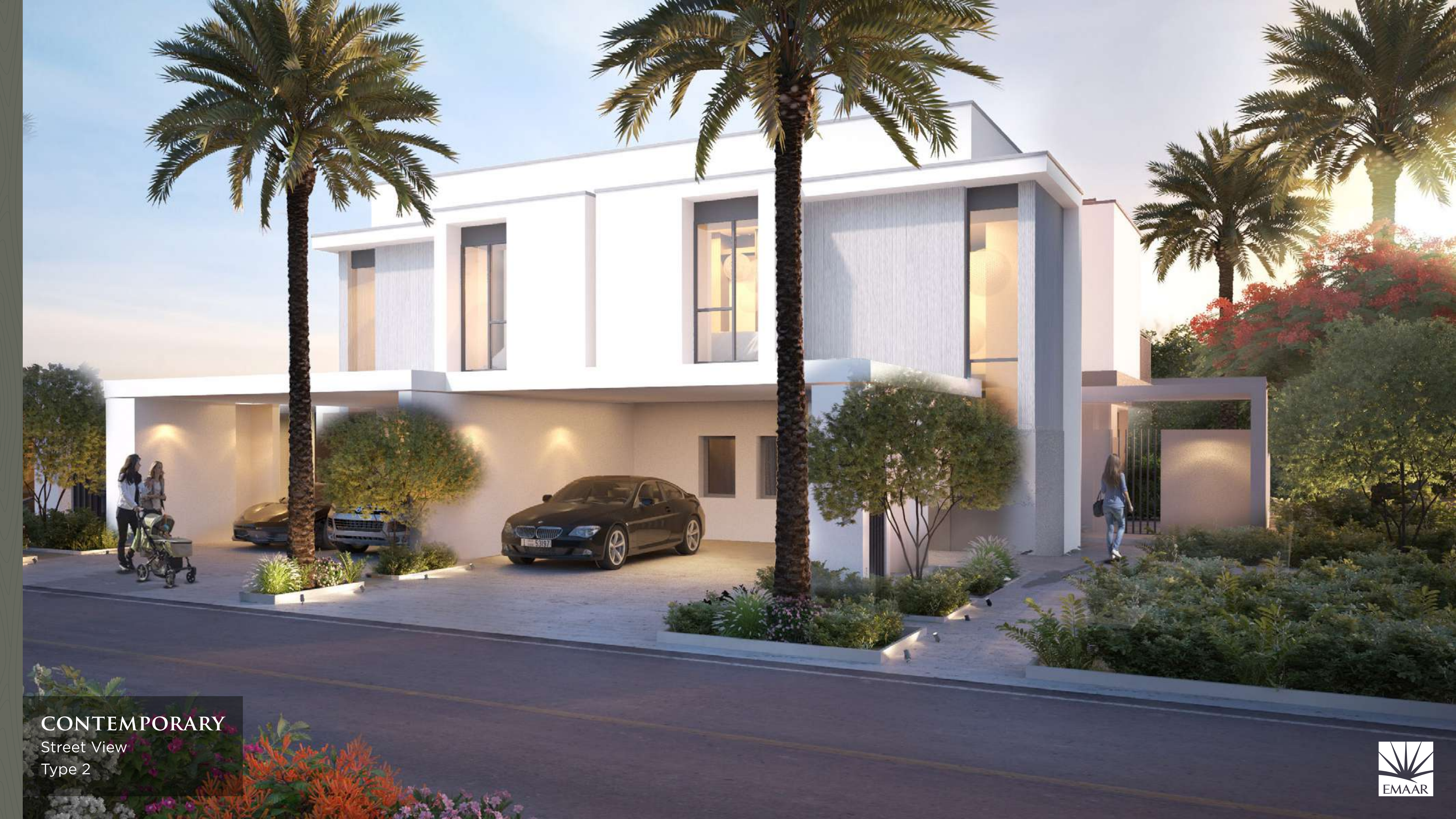
CONTEMPORARY Street View Type 2