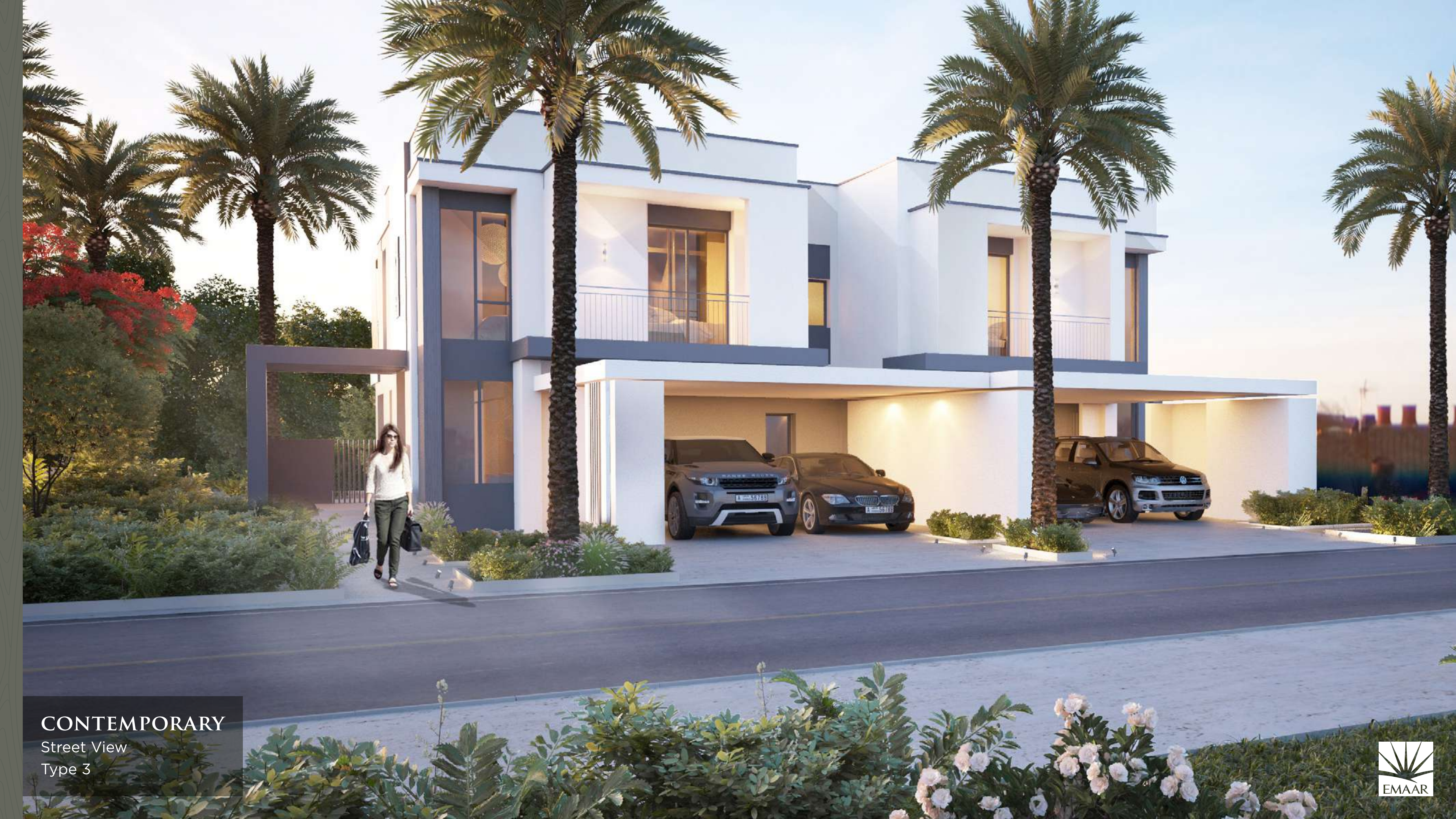
CONTEMPORARY Street View Type 3