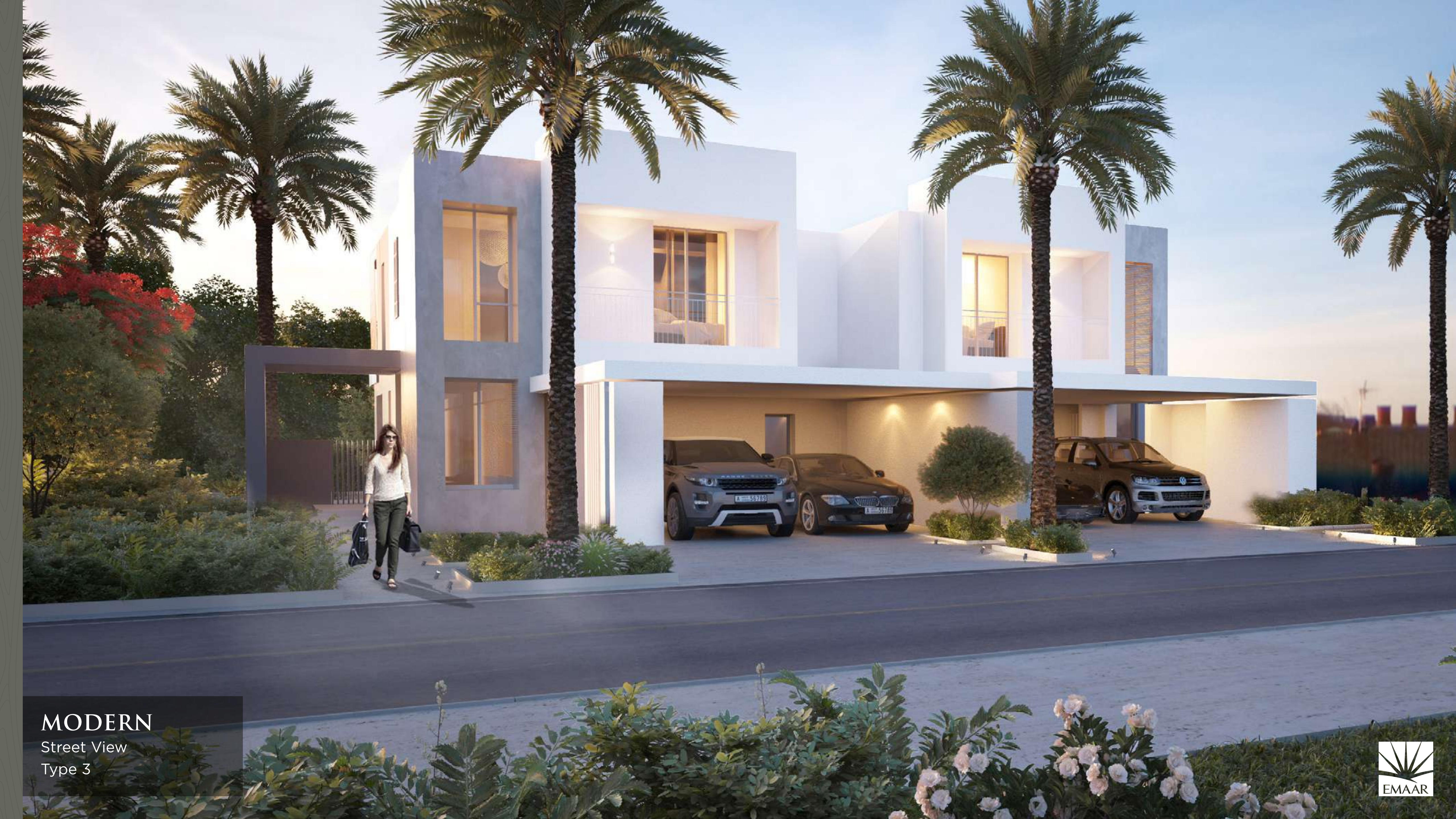
MODERN Street View Type 3