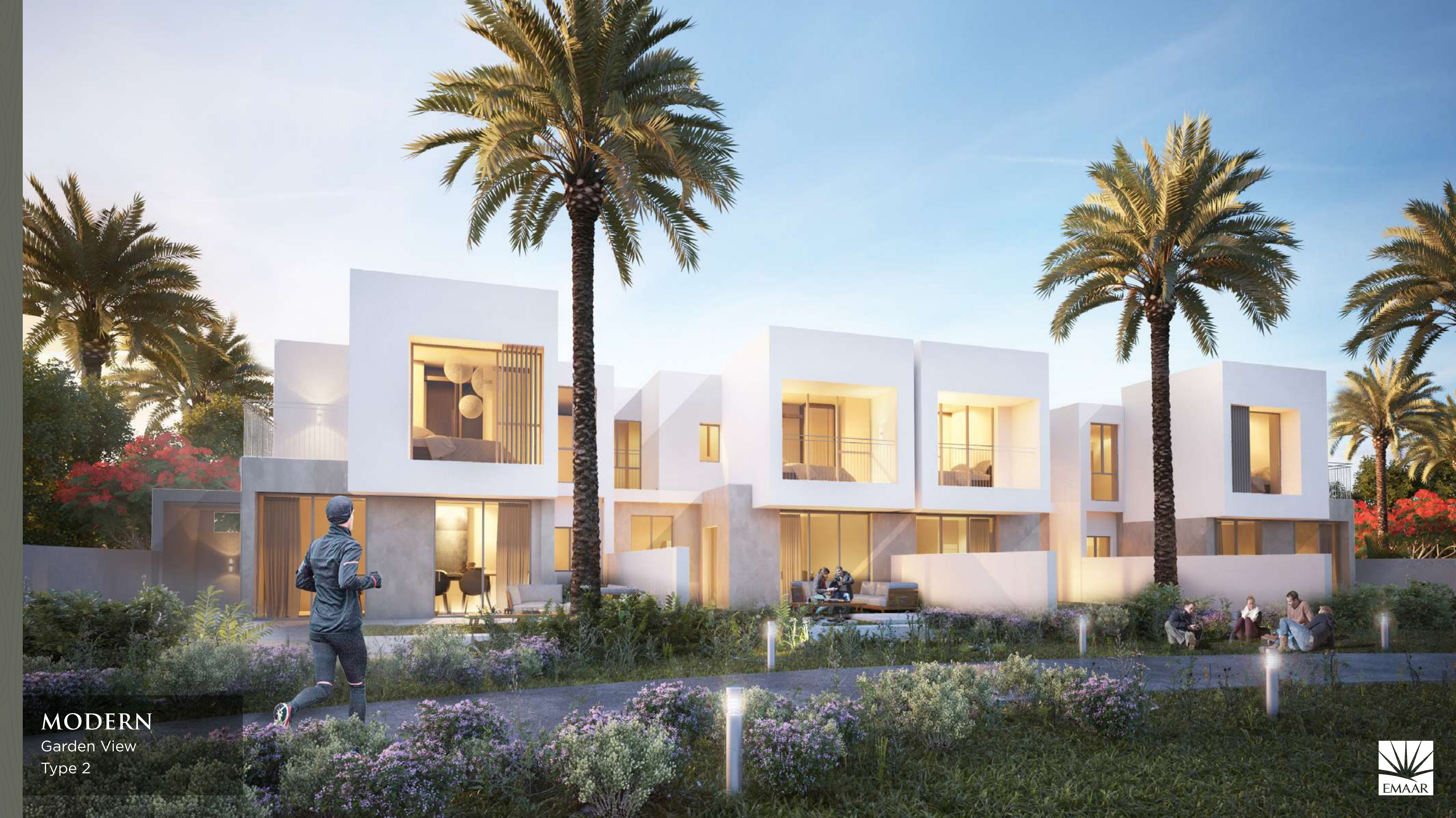
MODERN Garden View Type 2