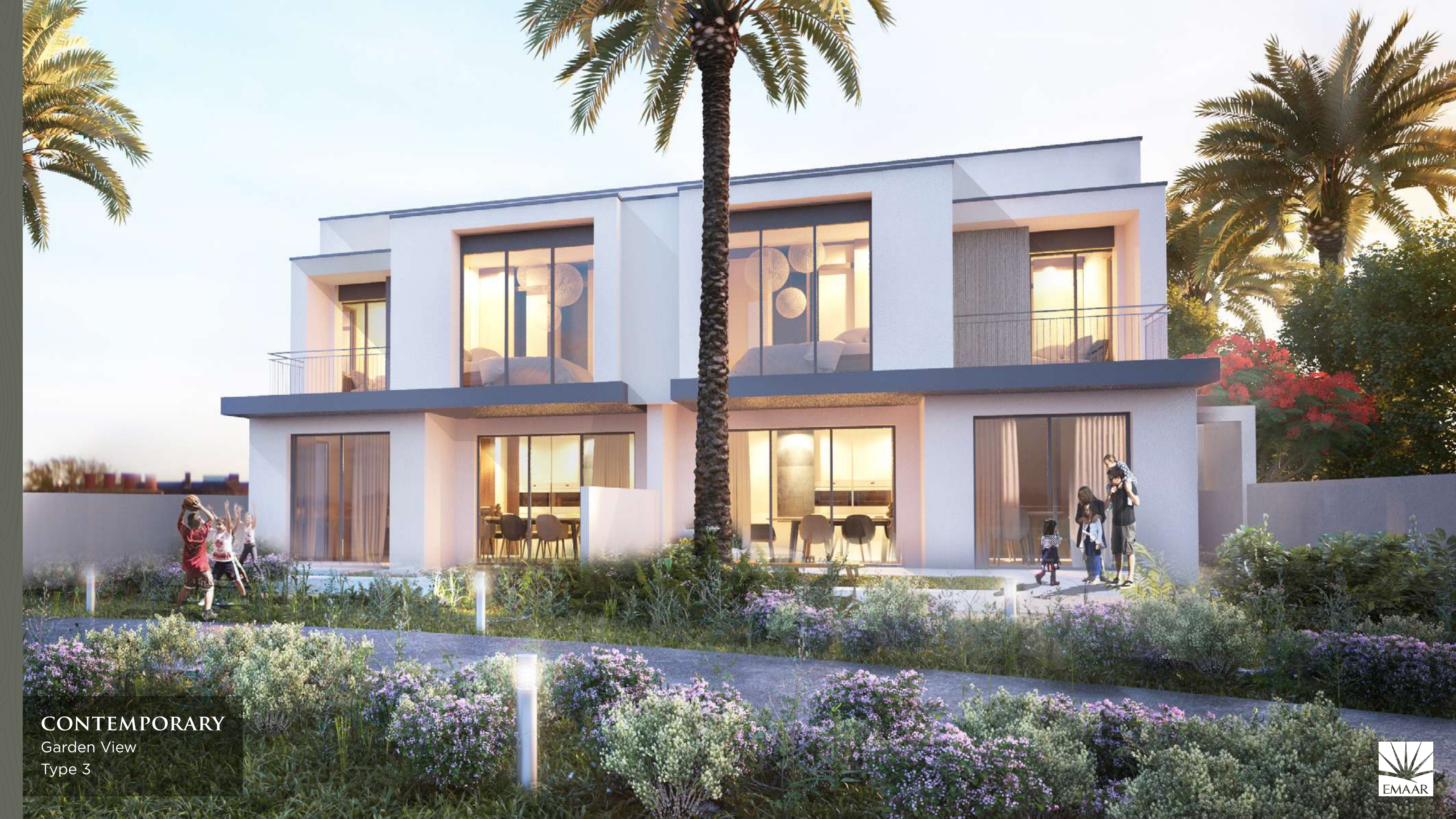
CONTEMPORARY Garden View Type 3