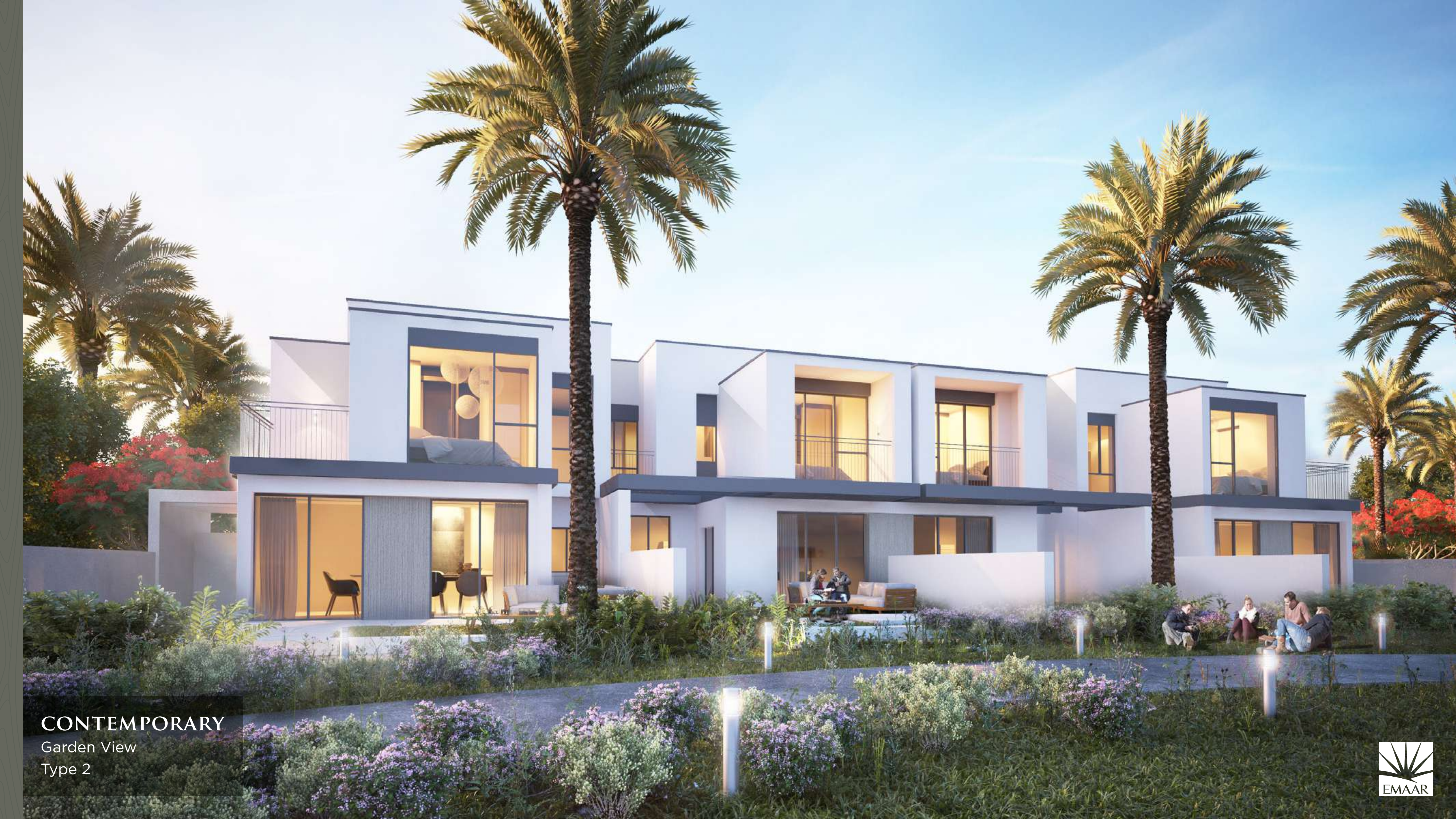
CONTEMPORARY Garden View Type 2