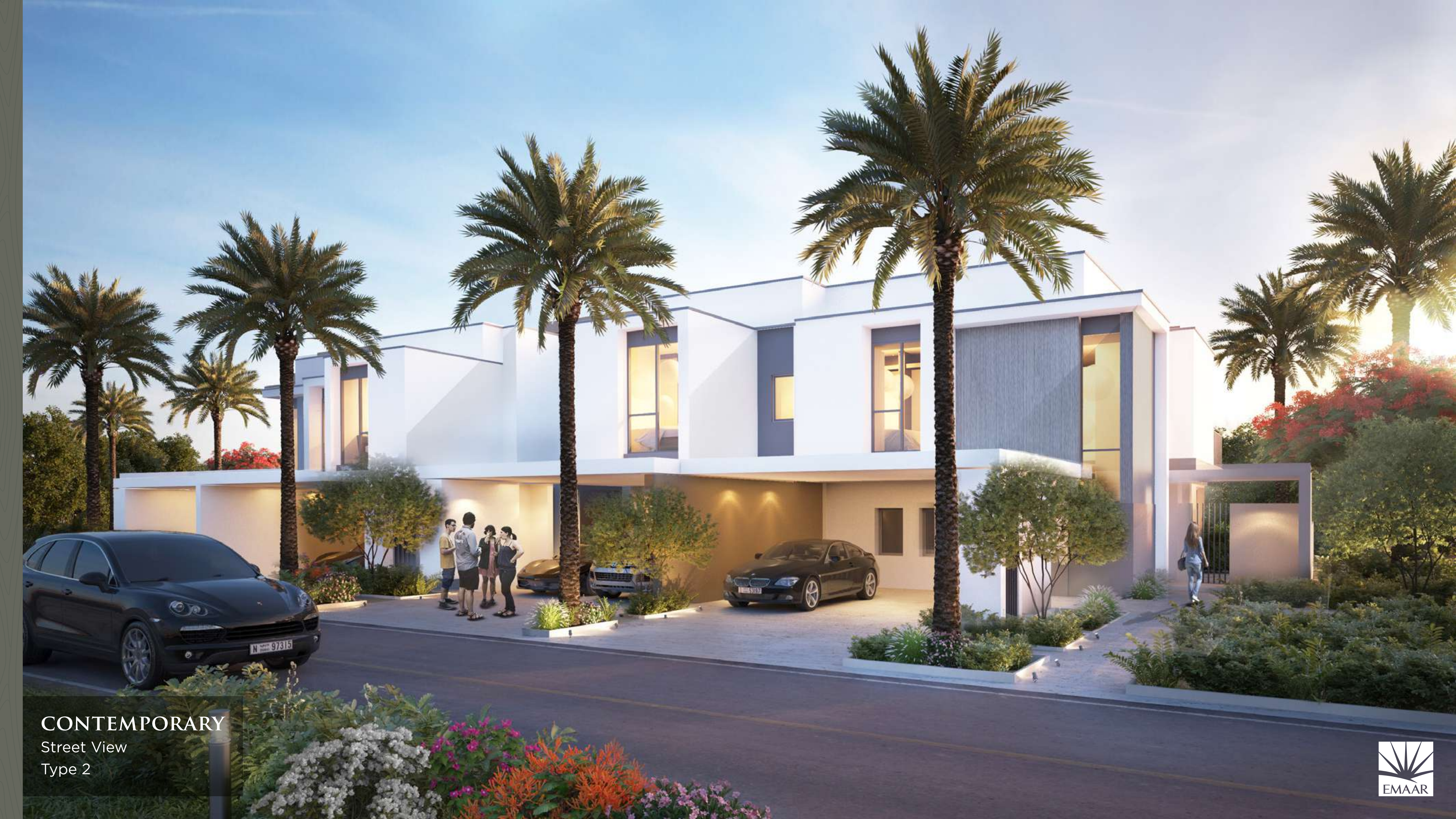
CONTEMPORARY Street View Type 2