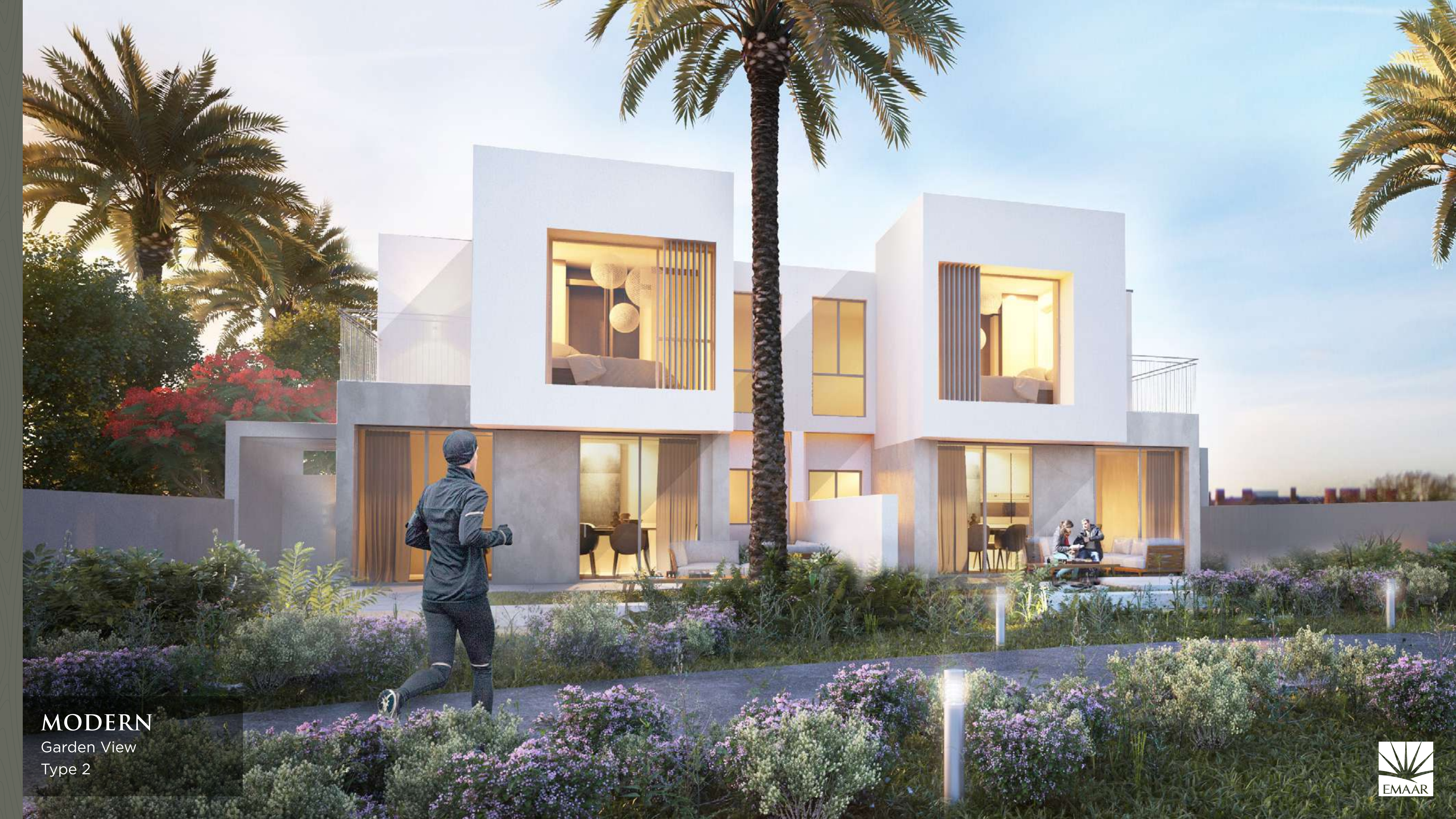
MODERN Garden View Type 2