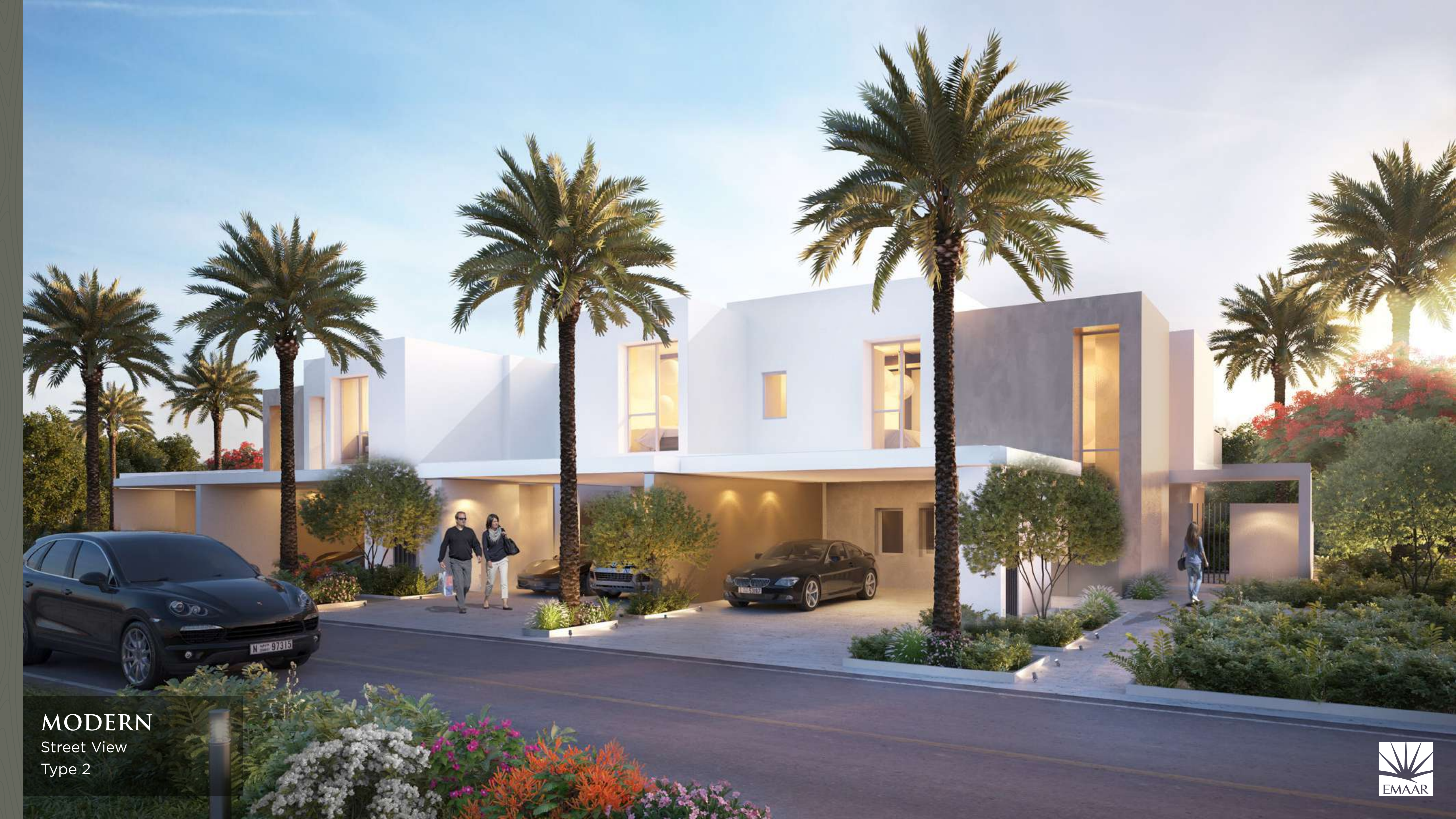
MODERN Street View Type 2