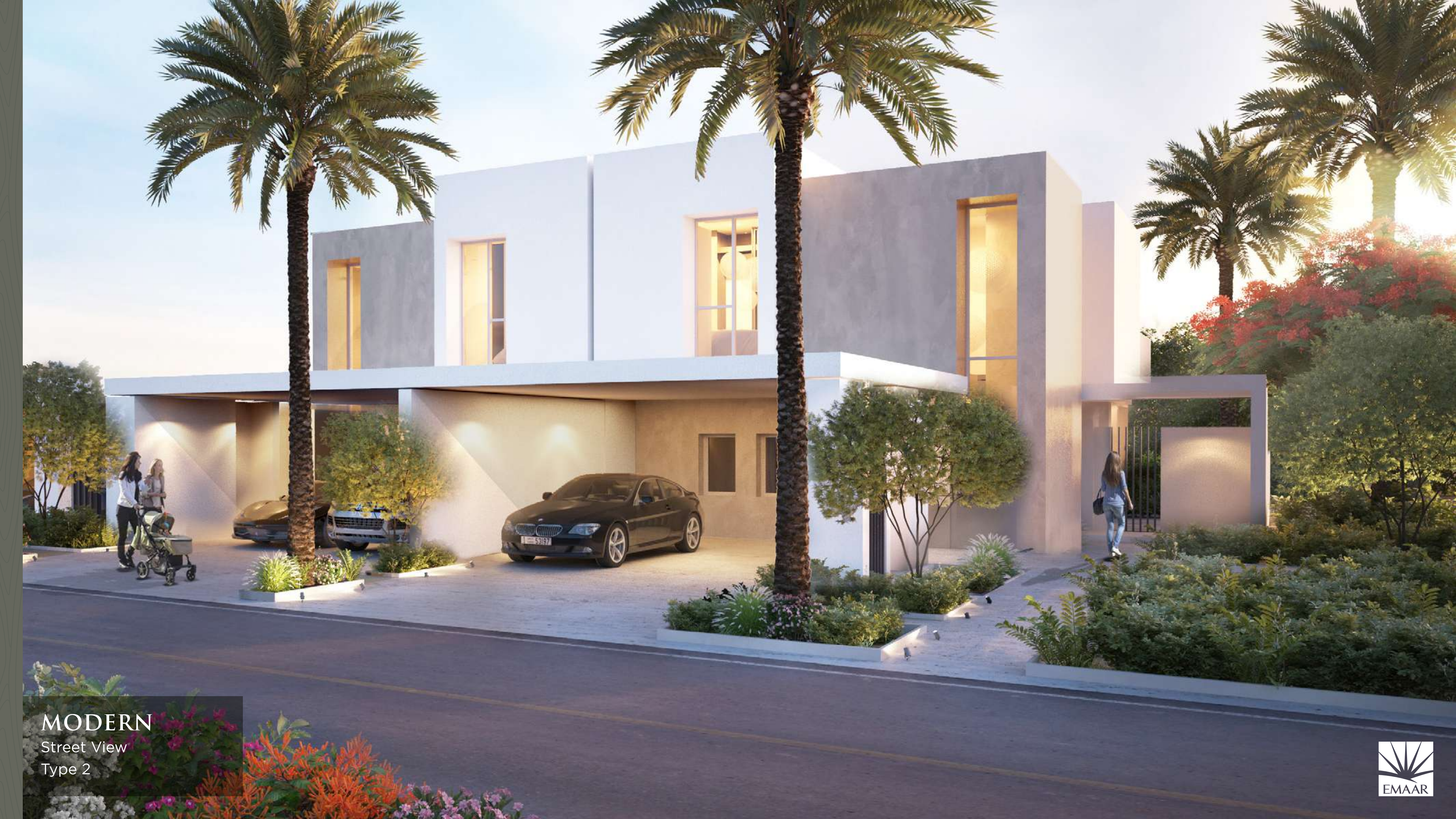
MODERN Street View Type 2