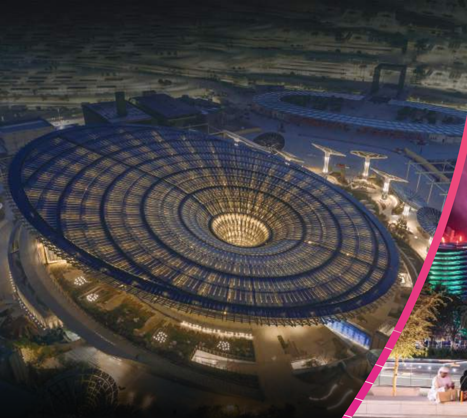
Terra – The Sustainability Pavilion Providing real life solutions to preserve our planet