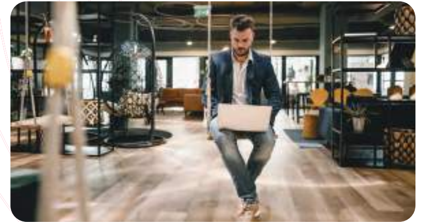
Various lounges for movies, co-working, art, and music