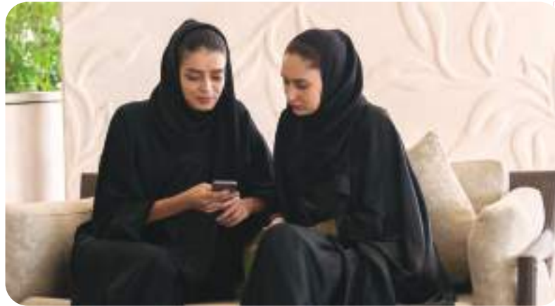
Clubhouse, function rooms, reading rooms