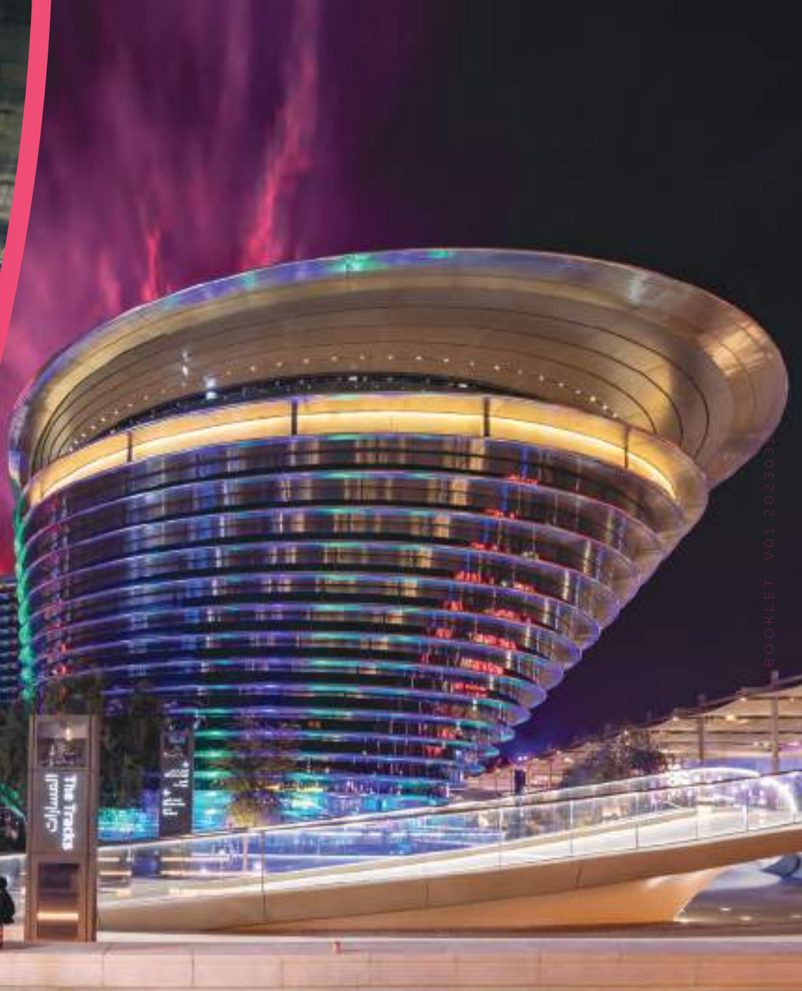
Alif – The Mobility Pavilion Exploring how we move, explore and connect