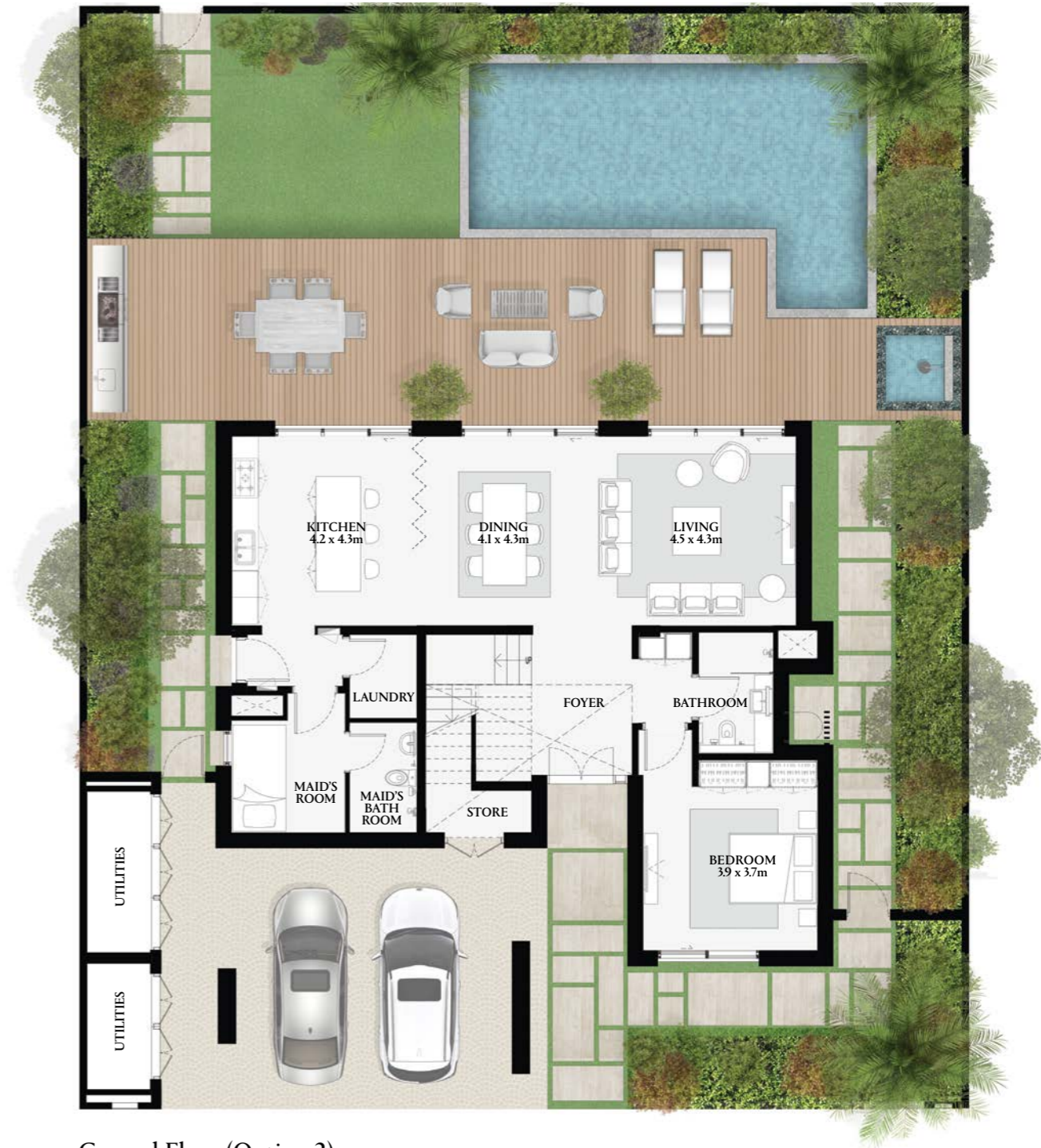
Ground Floor (Option 2)