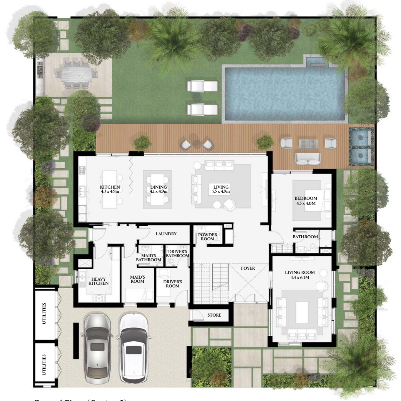
Ground Floor (Option 2)