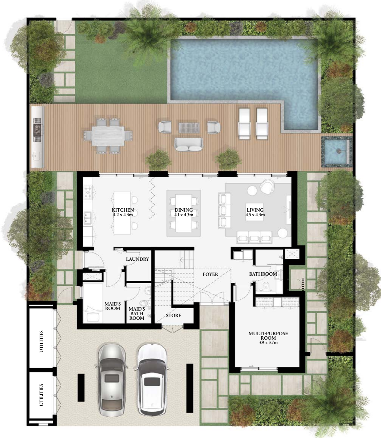
Ground Floor (Option 1)