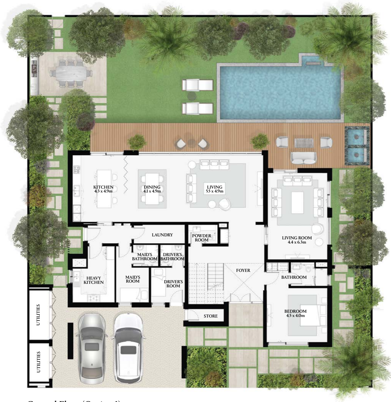
Ground Floor (Option 1)