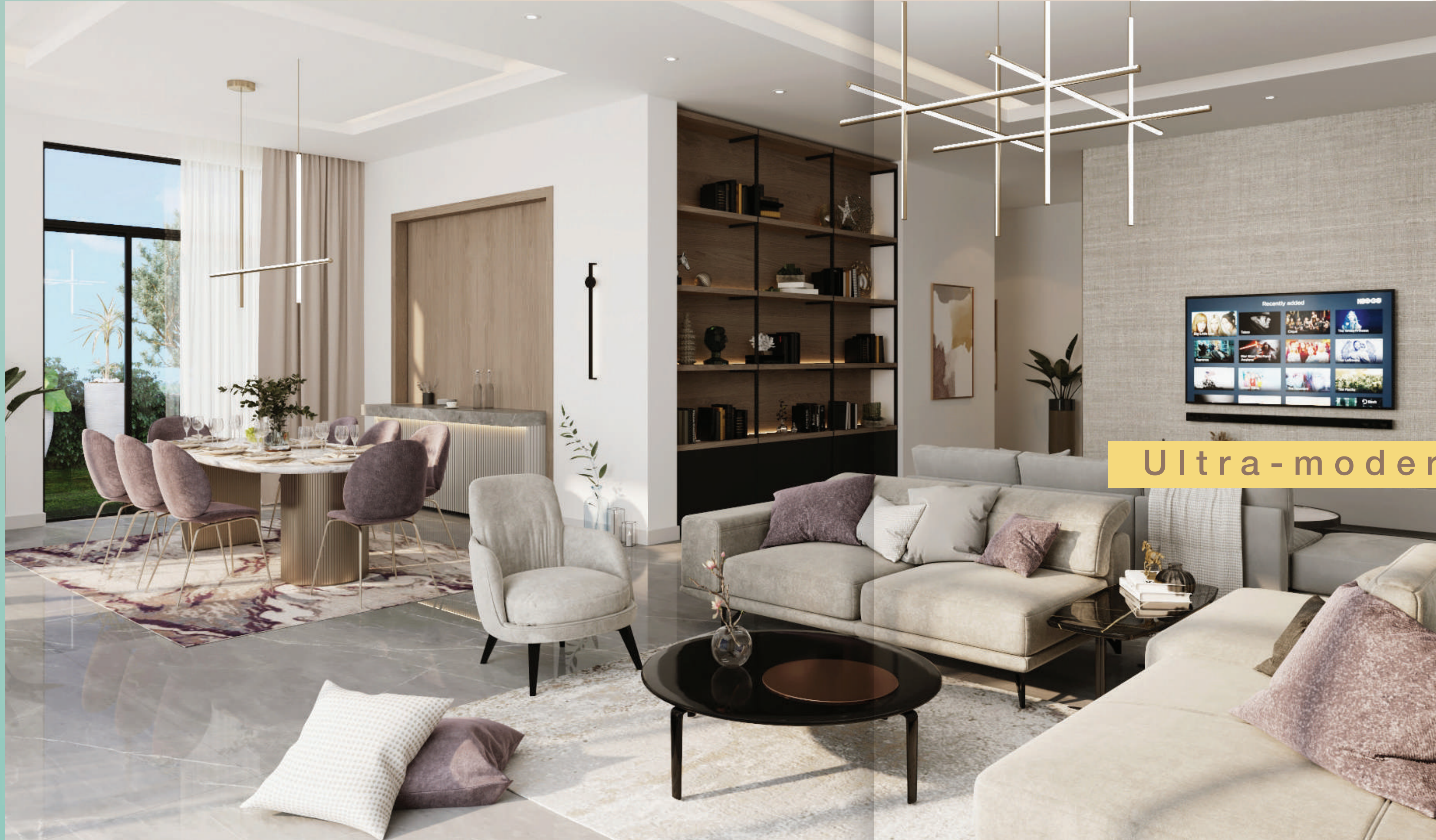
Ultra-modern living room