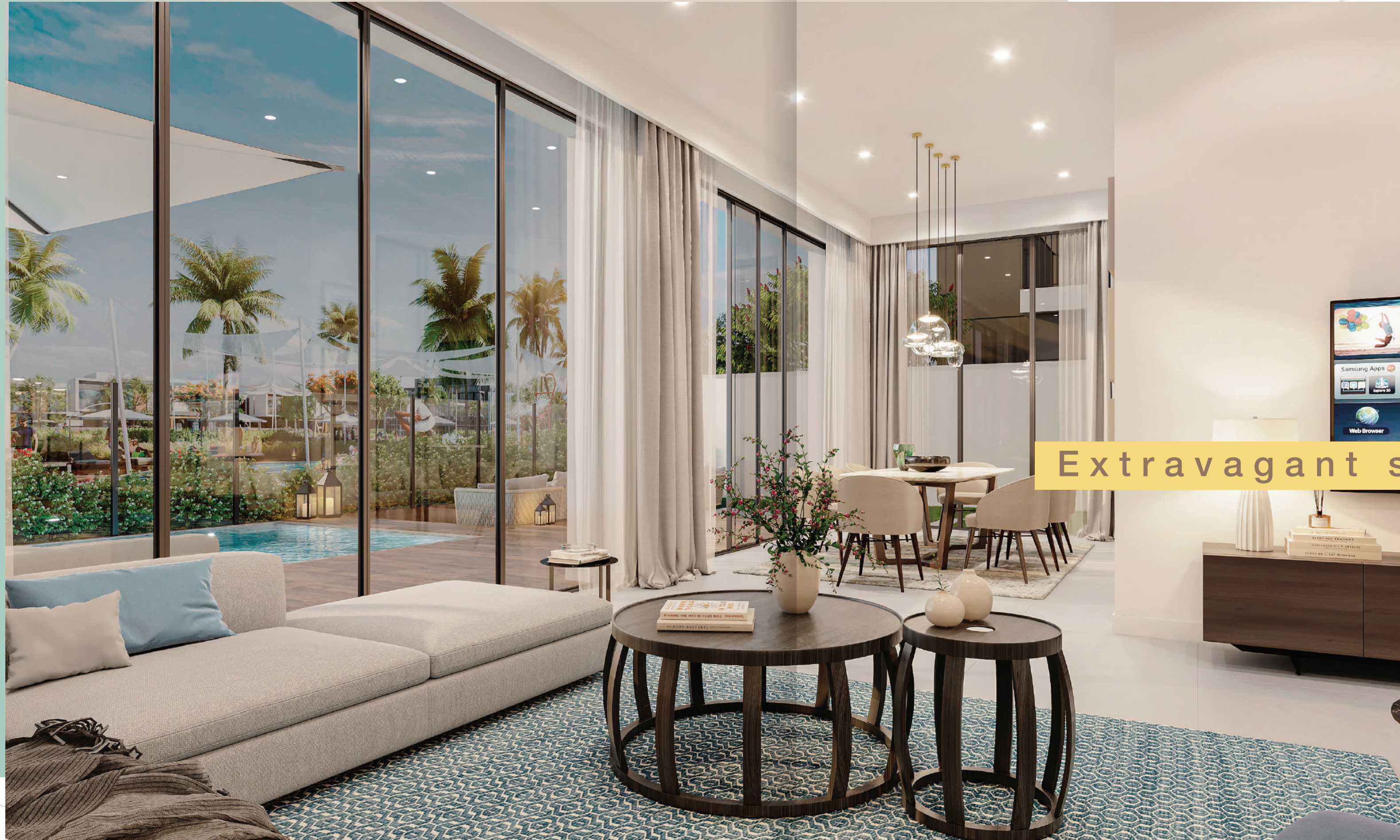
Extravagant sitting room