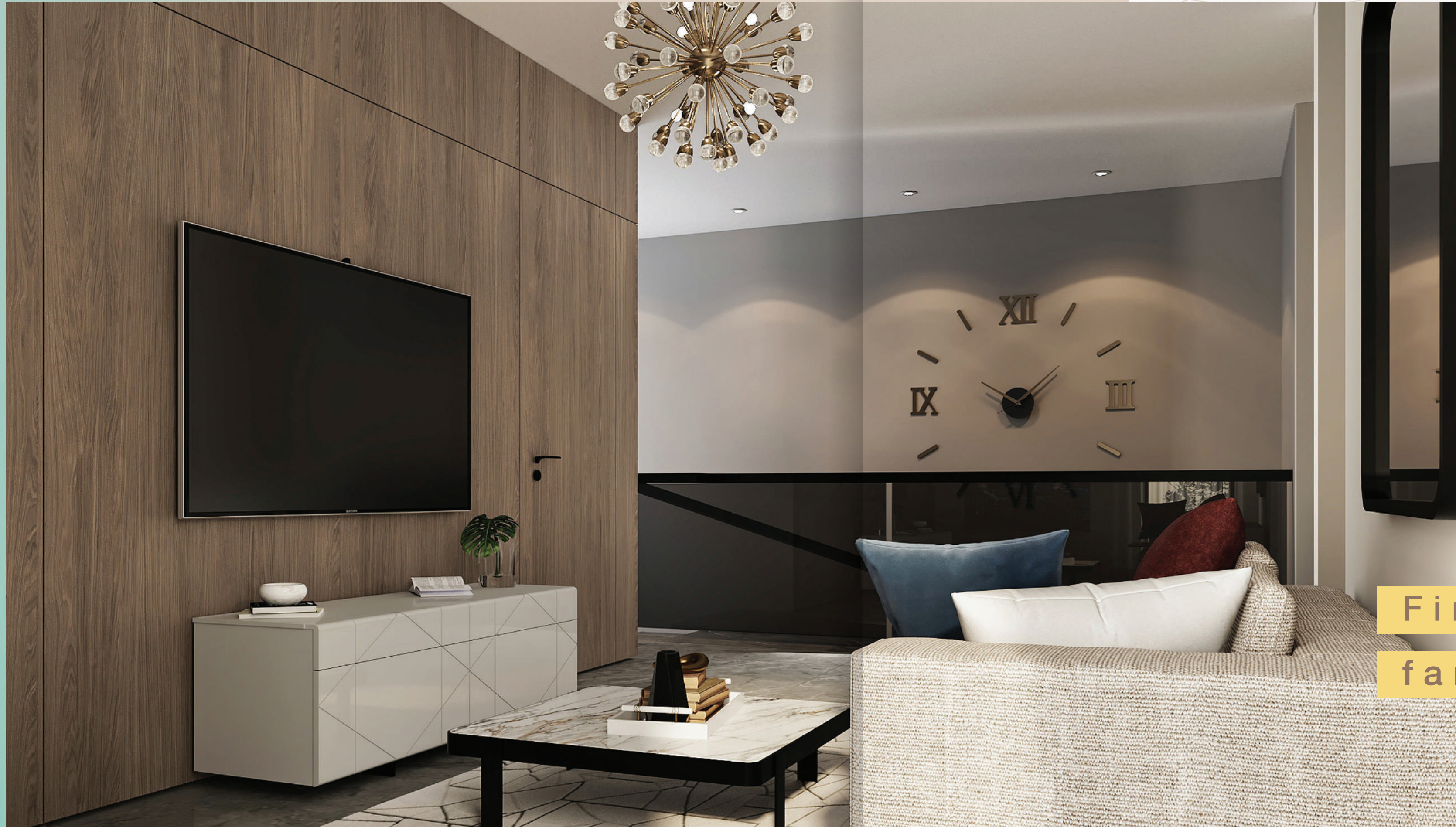
First floor family room