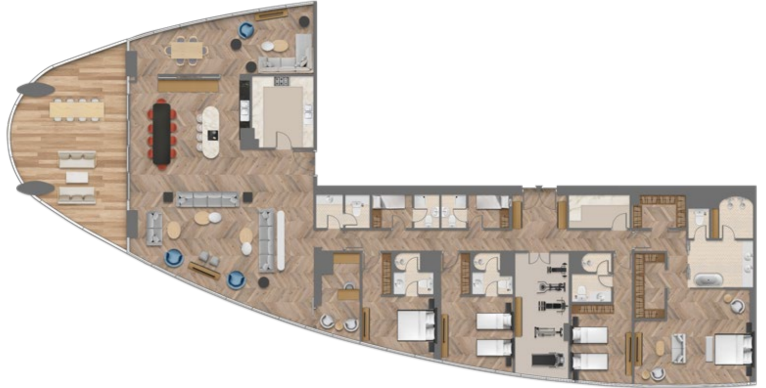
4 BEDROOM APARTMENT, SIMPLEX