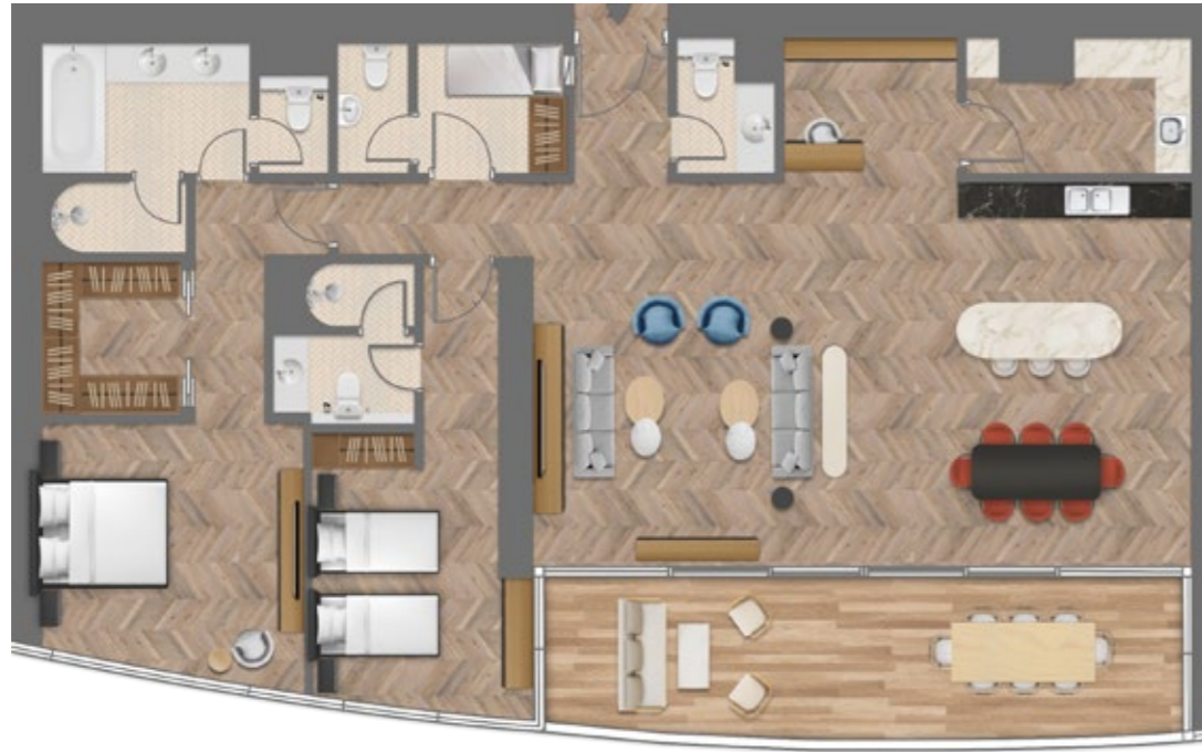
2 BEDROOM APARTMENT, TYPE C