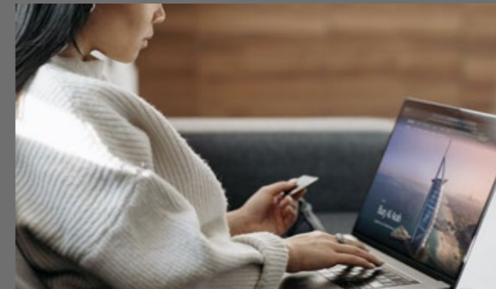
Pay with Points