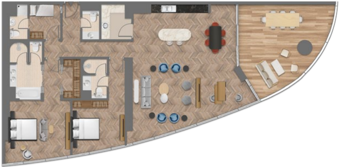
2 BEDROOM APARTMENT, TYPE B