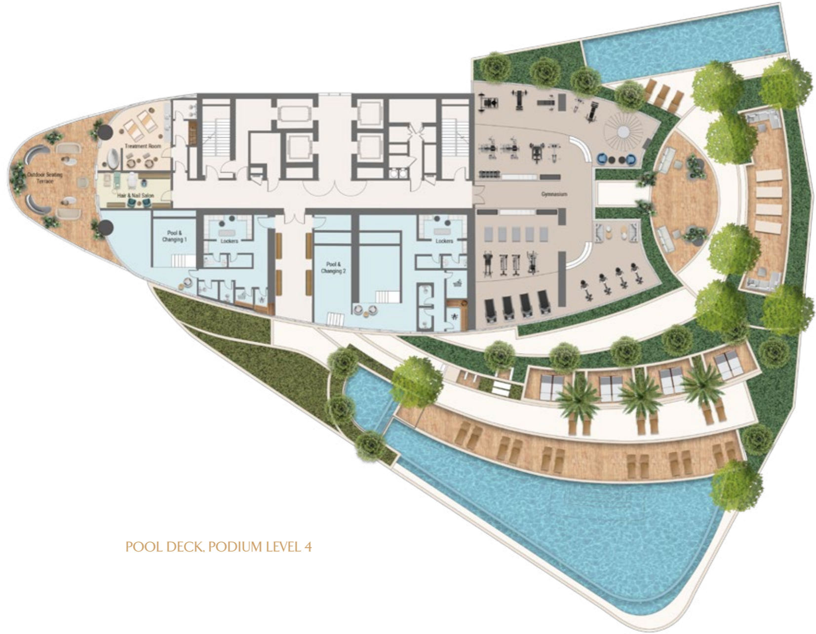
POOL DECK, PODIUM LEVEL 4