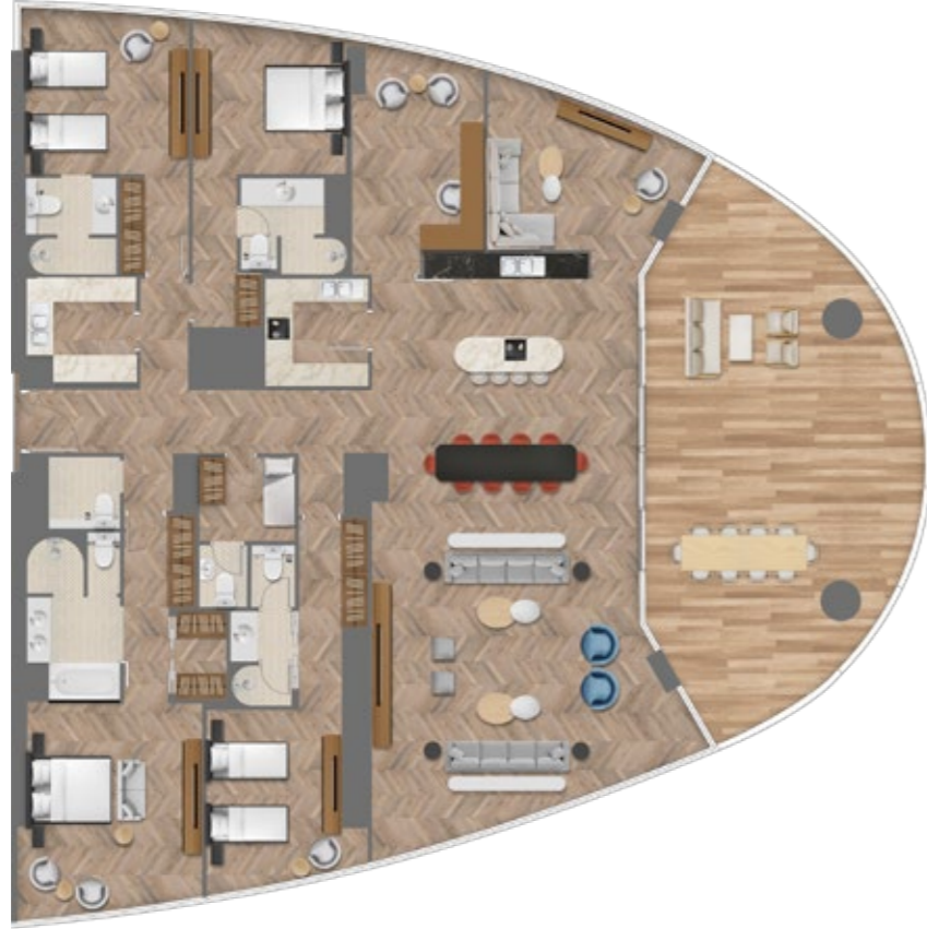
4 BEDROOM APARTMENT, TYPE A