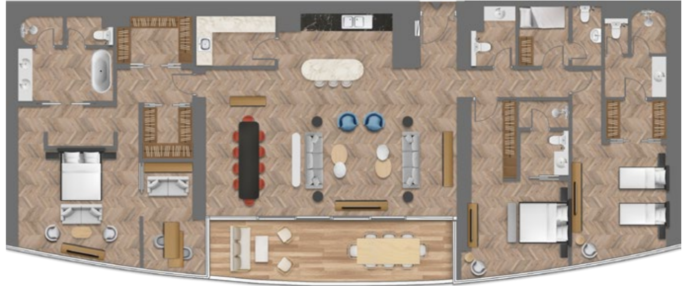
3 BEDROOM APARTMENT, TYPE C