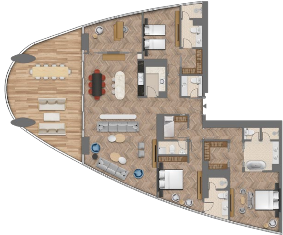
3 BEDROOM APARTMENT, TYPE A