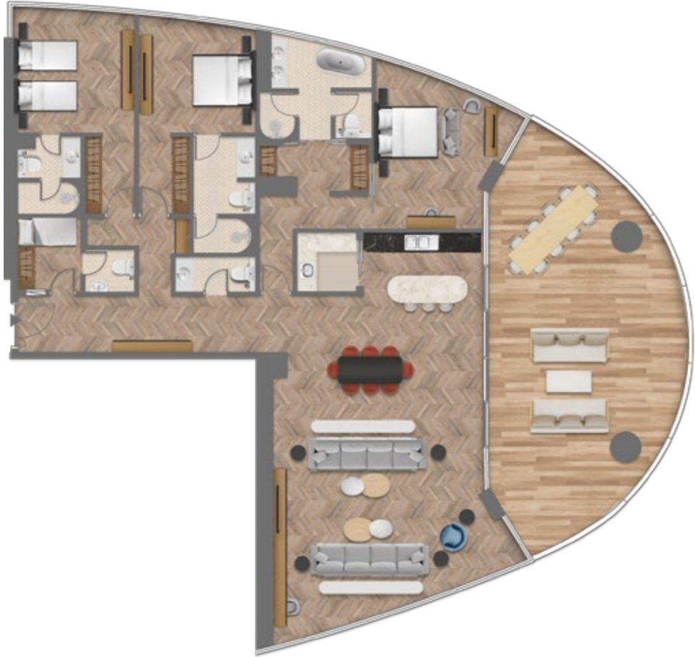
3 BEDROOM APARTMENT, TYPE B