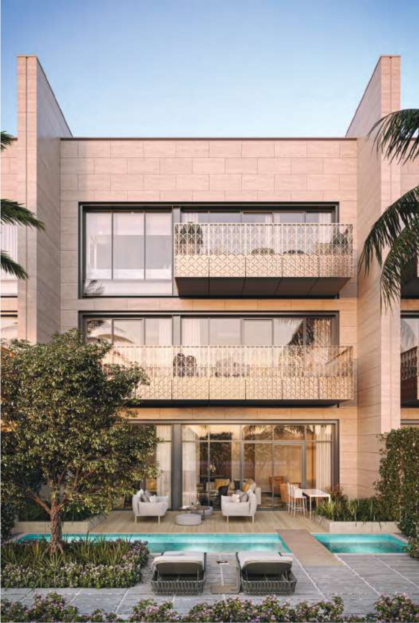
GARDEN TERRACE AND POOL

The grand-scaled living and dining rooms open onto the lushly landscaped pool and garden oasis making these amongst the most desirable private entertaining spaces in Dubai. On the upper bedroom levels, expansive balconies offer private havens overlooking the Water Canal and downtown skyline.