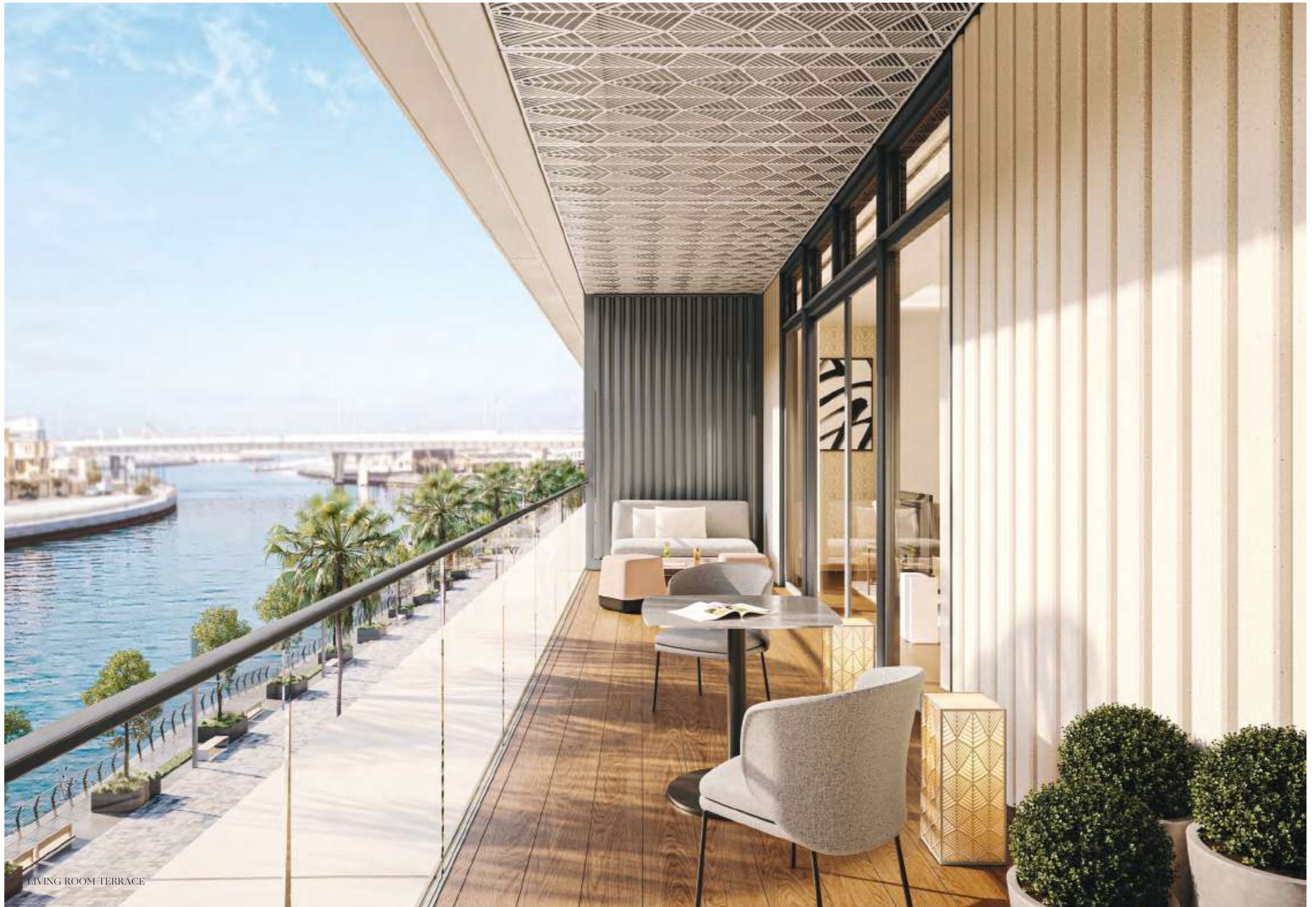
LIVING ROOM TERRACE