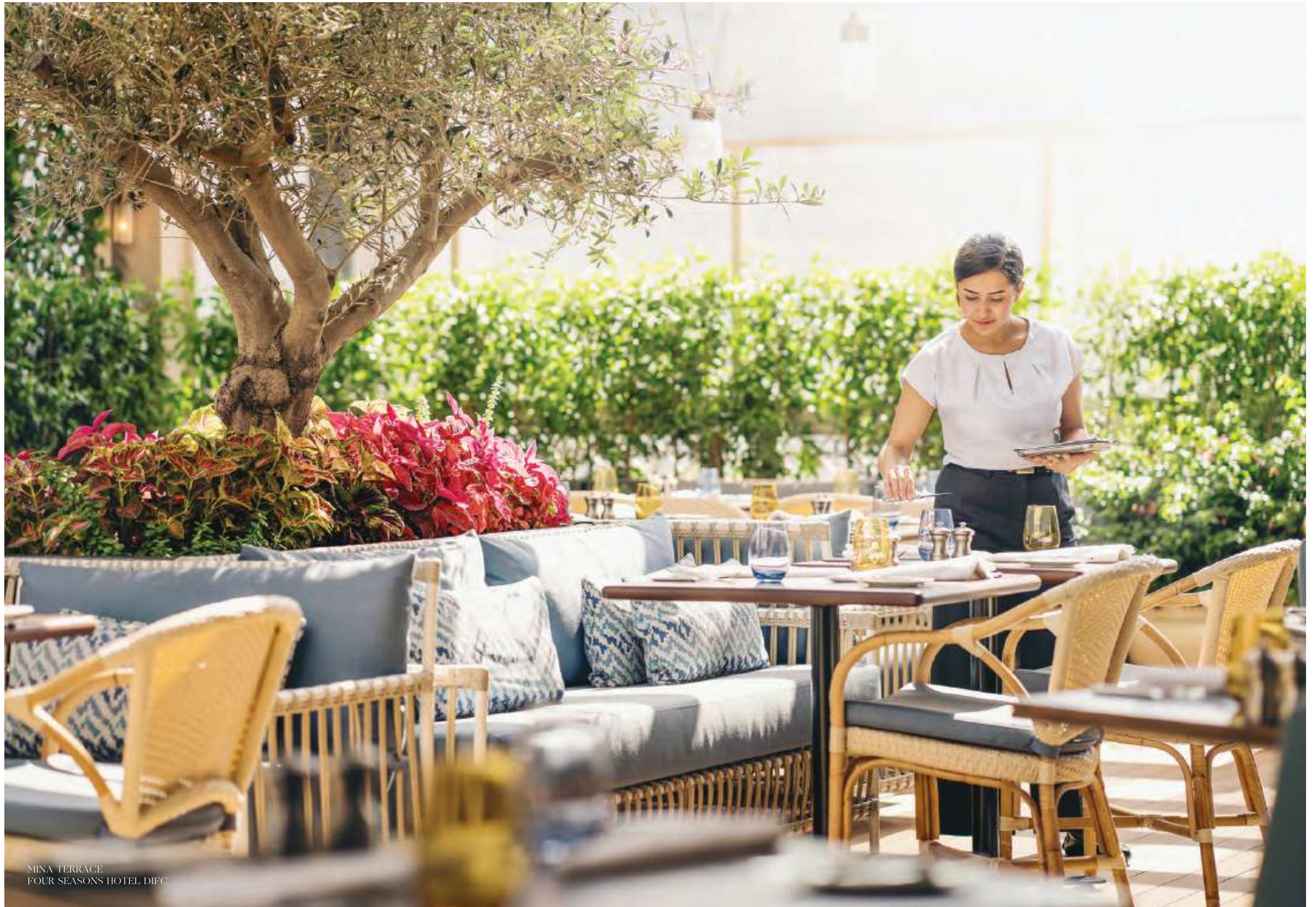
MINA TERRACE FOUR SEASONS HOTEL DIFC