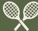
Squash & Tennis Court